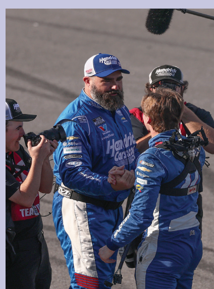
Former NFL All-pro Jason Kelce, left, congratulates Corey Day, driver of the #17 HendrickCars.com Chevrolet, for winning Saturday's Ag-Pro 300 at Talladega Superspeedway.