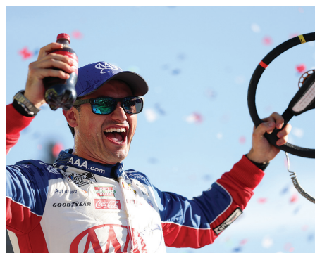
Joey Logano won last May's race at Texas.