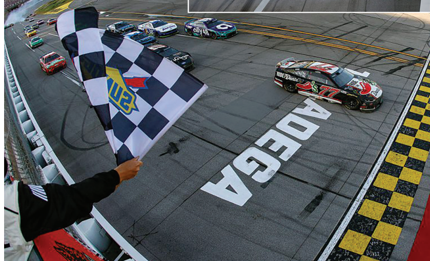
Carson Hocevar, driver of the No. 77 Spire Motorsports Chevrolet, captures his first career Cup Series win with a stellar showing at Talladega Sunday.