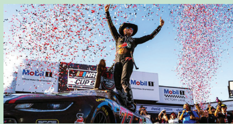
Carson Hocevar in Victory Lane Sunday at Talladega.

"I'm so thankful. This is the biggest dream I've ever thought of. Thank you, everybody. I couldn't have done it in any better way. Hopefully my grandpa's watching. My grandma died last year, so I'm so thankful that I can give my grandpa a trophy now. Wish my parents were here." — Carson Hocevar, who grabbed his first Cup win in 91 starts Sunday in the Jack Link's 500