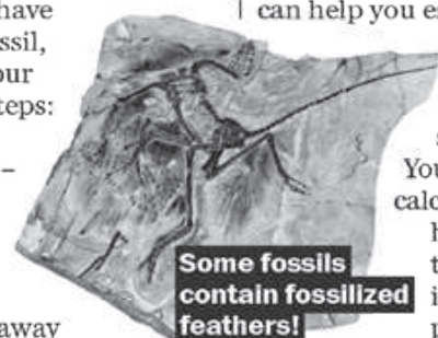
Some fossils contain fossilized feathers!

After the find Once you've studied your fossil, prepare it for display. If it's a new species, you'll have to think up a name!