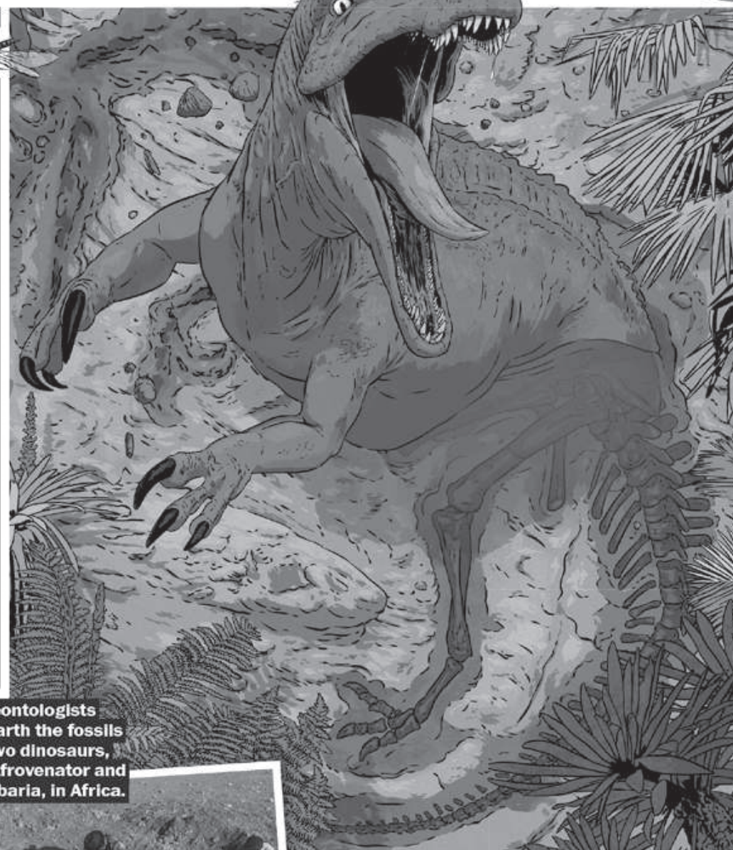
Paleontologists unearth the fossils of two dinosaurs, an Afrovenator and a Jobaria, in Africa.

You can also calculate roughly how old the fossil is through a process called