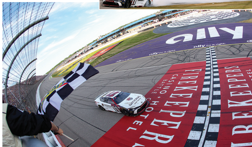
Denny Hamlin, driver of the #11 National Debt Relief Toyota, takes the checkered flag to win the Cup Series FireKeepers Casino 400 at Michigan International Speedway on Sunday.