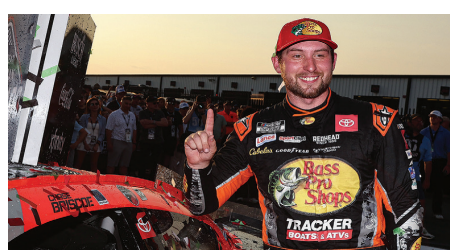
Chase Briscoe in Victory Lane after winning last year's Getaway 400.

• Of note: In May, Pocono Raceway completed a hat trick, earning "Best NASCAR Track" honors for the third consecutive year in the USA TODAY 10Best Readers' Choice Travel Awards. "The Tricky Triangle" won by fan vote after a four-week period in April. Pocono Raceway topped a field of 20 tracks, finishing ahead of COTA, Las Vegas, Watkins Glen and Richmond, respectively.