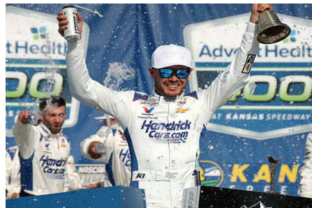
Kyle Larson won last year's Spring race at Kansas in dominating fashion.

• Fastest Cup lap: 0:28.857 Kyle Larson, SpongeBob SquarePants 400, 2015