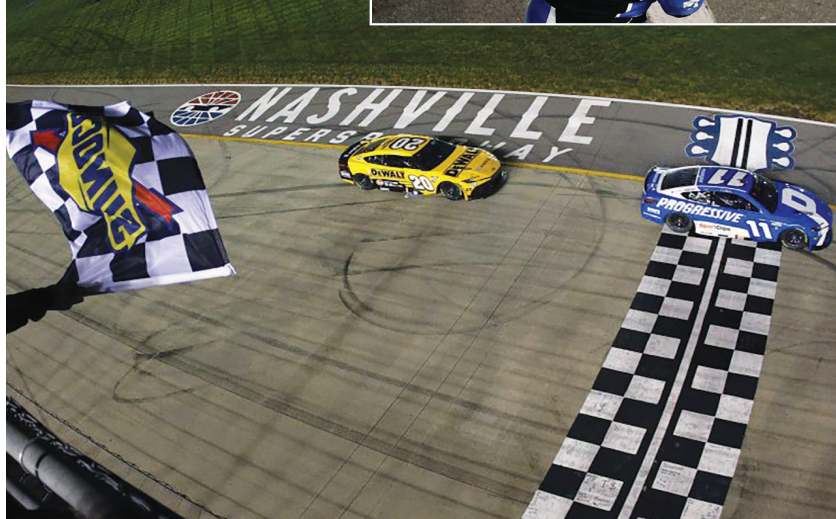
Denny Hamlin prevails Sunday at Nashville, claiming his second win of the 2026 season. He then honored his longtime Joe Gibbs Racing teammate, Kyle Busch, with a showman's bow (top).