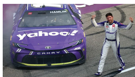
Denny Hamlin in Victory Lane after winning last year's FireKeepers 400.