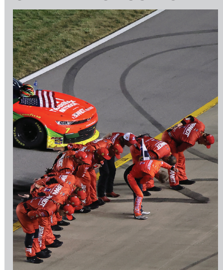
Justin Allgaier, driver of the #7 BRANDT/Precision Build/Trademark Chevrolet, and crew take a bow in tribute to the late Kyle Busch after winning Saturday's Sports Illustrated Resorts 250 at Nashville Superspeedway.