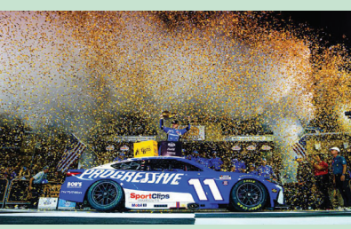
Denny Hamlin in Victory Lane Sunday at Nashville.

"The 20 (Christopher Bell) and 19 (Chase Briscoe) were battling so hard on that first corner it just let me get to the inside of the 20 at the first corner after the restart and from there, side-by-side with the 20. He [Bell] drove in so deep on that last lap into [turn] one that it just allowed me to barely clear off of [turn] two." — Denny Hamlin, who led the way for Joe Gibbs Racing Sunday at Nashville