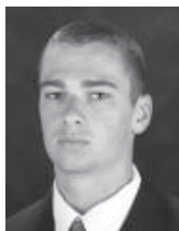
7 Jack Russell