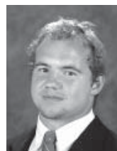
44 Chris Borland