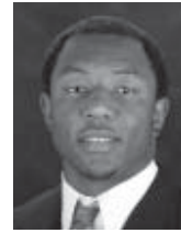
16 Reggie Love