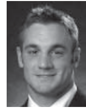
Ben Strickland Secondary