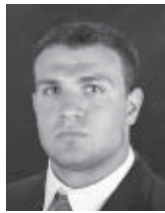
76 Arthur Goldberg