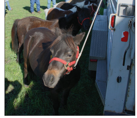
The Isanti County Miniature Horse Project brought miniature horses to the Cambridge Customer Appreciation event for people to enjoy.