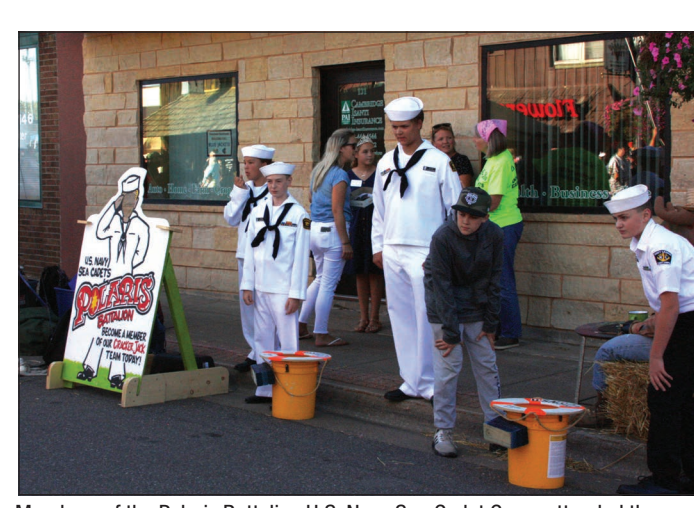
Members of the Polaris Battalion U.S. Navy Sea Cadet Corps attended the event and had games for kids to play.