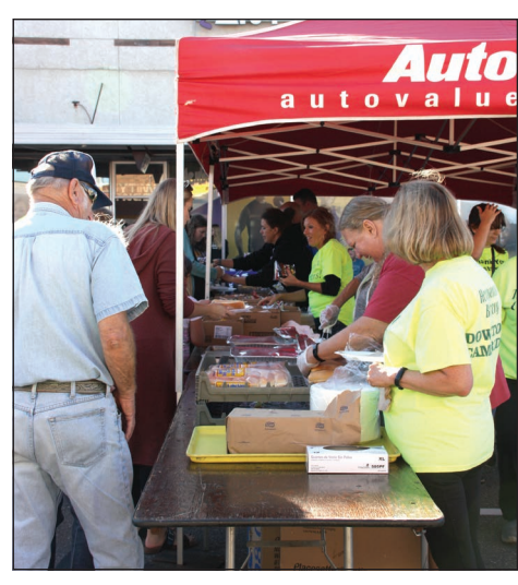
Volunteers from different businesses and organizations served many people from the community who attended the event.