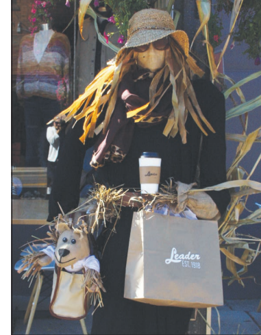
The Leader was the third place winner in