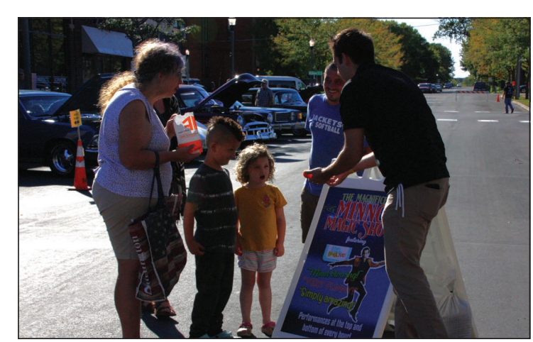
The Minnco Magic Show was a big hit during the event.