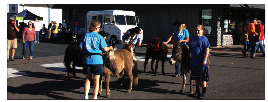
The miniature horses and donkey were walked through the event.