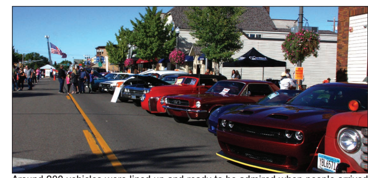
Around 200 vehicles were lined up and ready to be admired when people arrived to the Customer Appreciation Event.