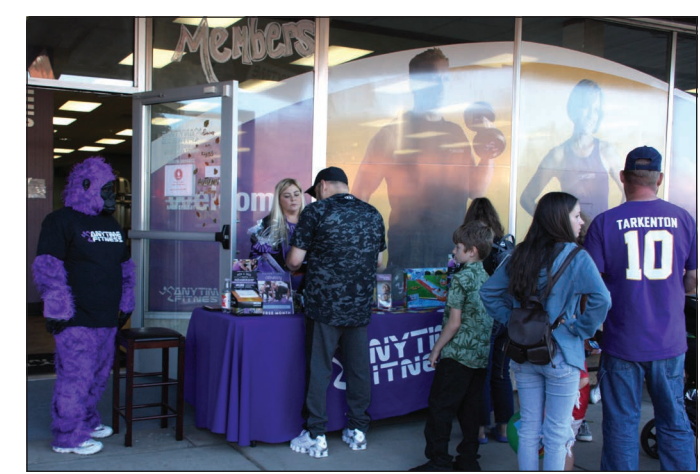
Anytime Fitness drew a crowd with their gorilla mascot.