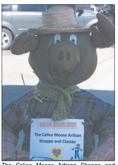
Classes was the first place winner in the