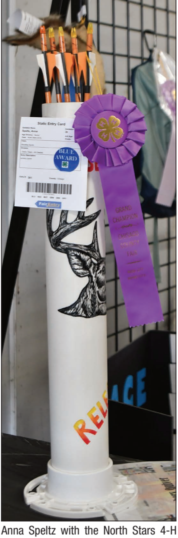
Club received the Grand Champion Purple Ribbon for this entry in the Shooting Sports classification.