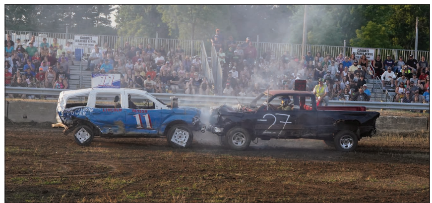
There was plenty of smoke in the area during the Demolition Derby on July 20.