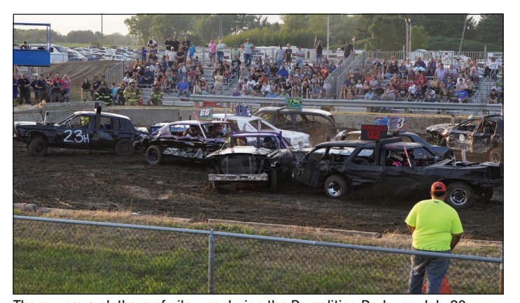
There were a plethora of pile-ups during the Demolition Derby on July 20.