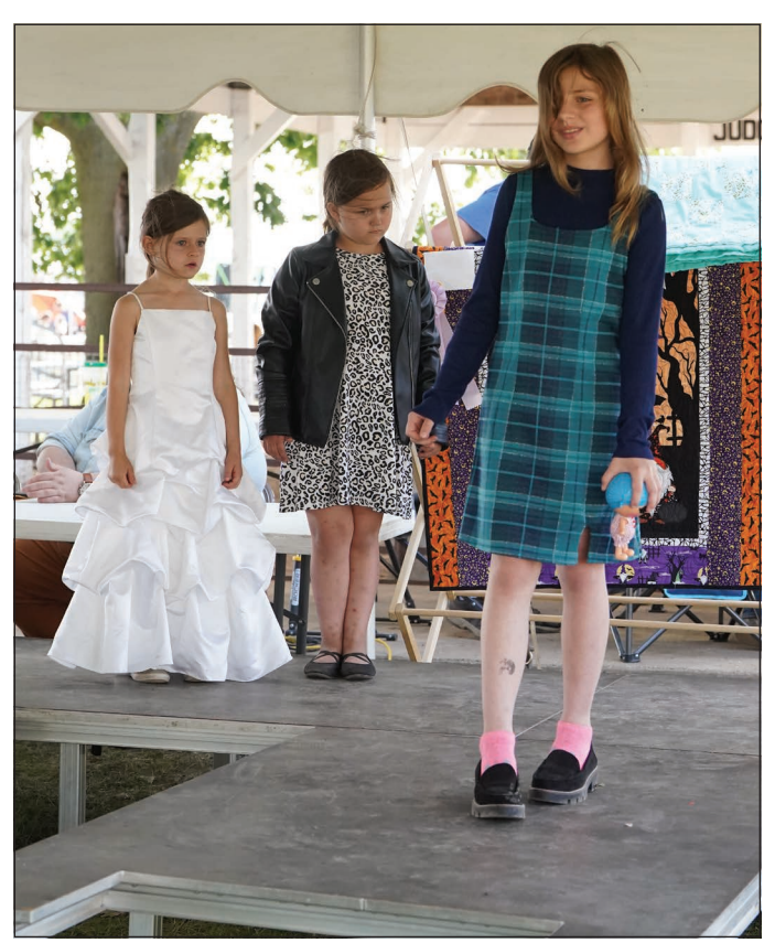
There were fun fashions on display during the 4-H Style Show.