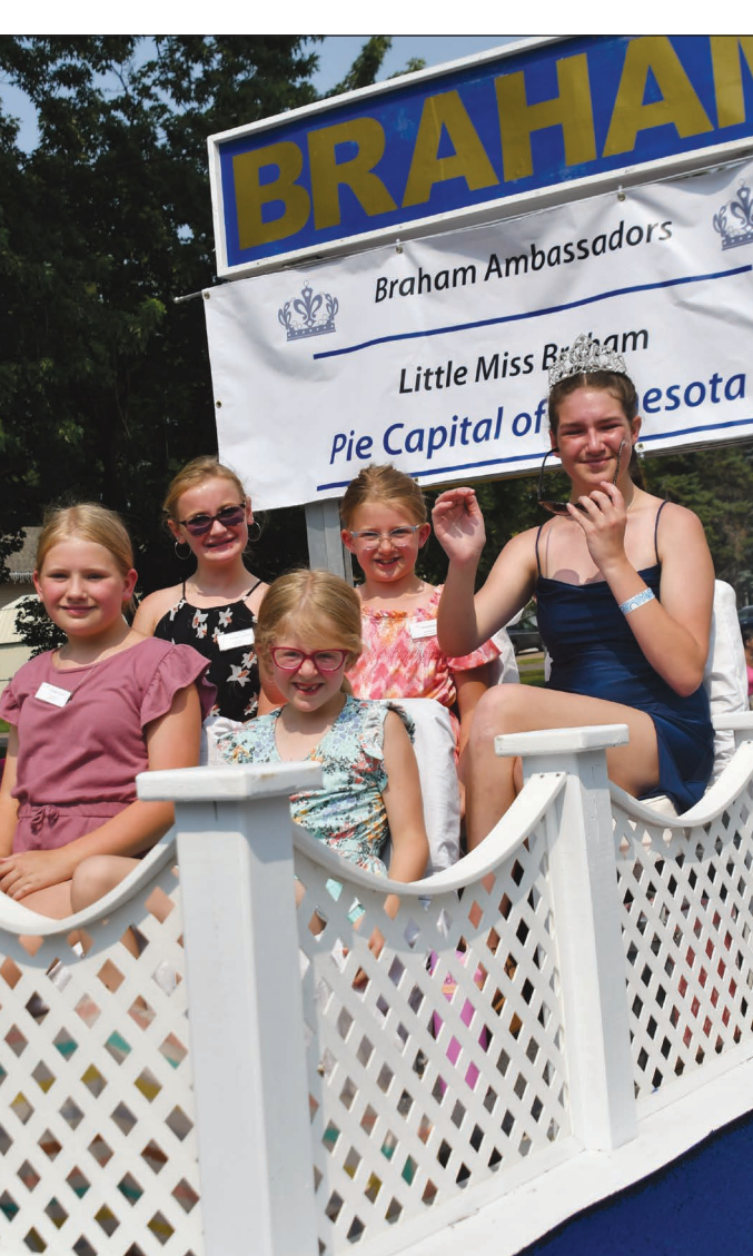
The Braham Ambassadors wave to the crowd gathered for the July 20 parade.