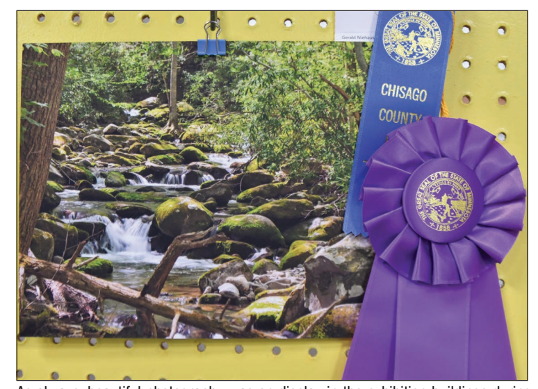
As always, beautiful photography was on display in the exhibition buildings during the Chisago County Fair.