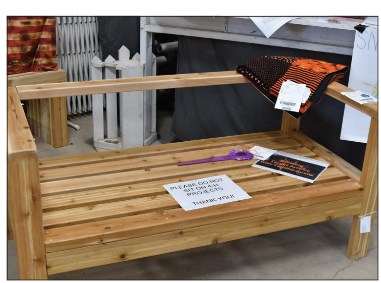
Beautiful wood working pieces were on display in the exhibition buildings.