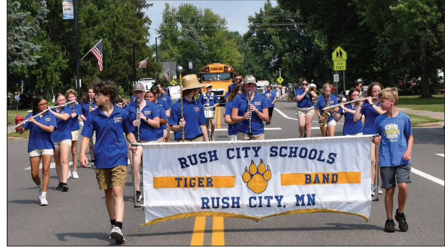
Members of the Rush City High School Marching Band provide entertaining music during the July 20 parade.

countynewsreview.com Thursday, July 25, 2024 Page 17