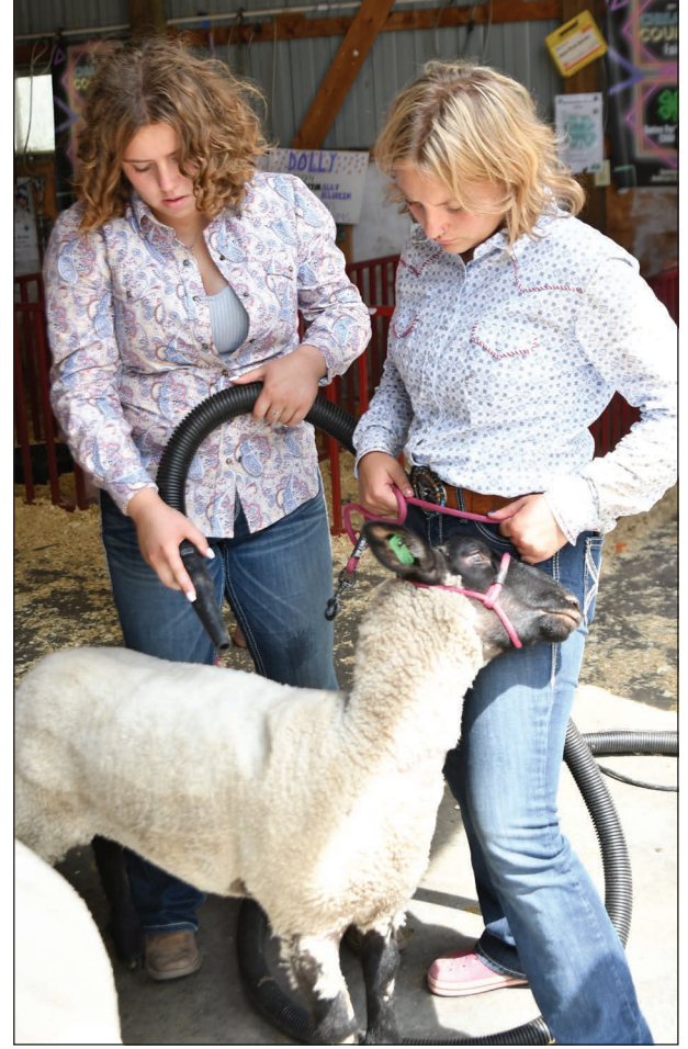
Preparing animals for show is a full-time job for animal owners during the Chisago County Fair.