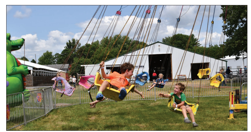
The swings are always a fun attraction on the midway.