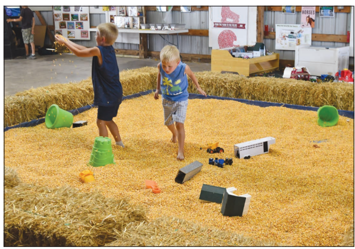
These two youngsters play around in the corn pit during the Chisago County Fair.