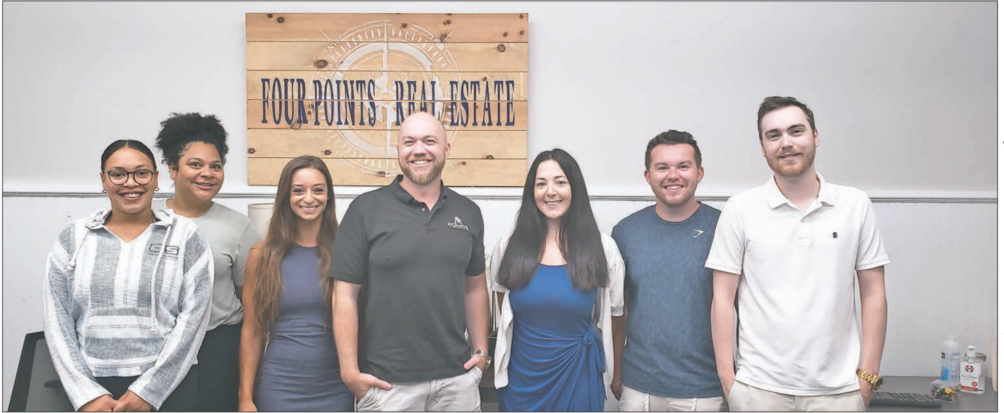
Four Points Real Estate Team