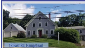
18 East Rd, Hampstead