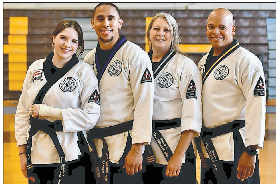
Ocasios True Martial Arts