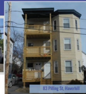
83 Pilling St, Haverhill