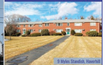
9 Myles Standish, Haverhill