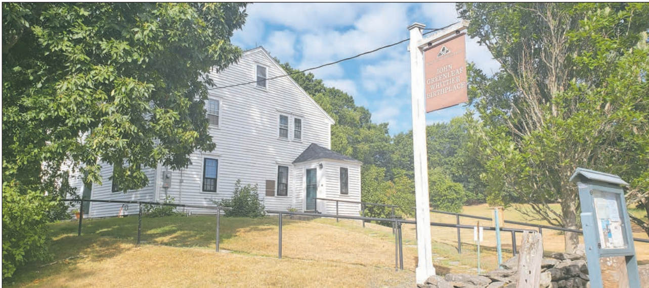
John Greenleaf Whittier Birthplace and Museum