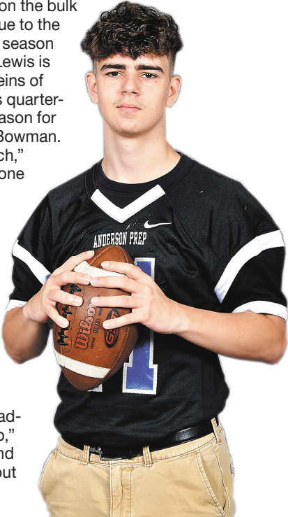
QUARTERBACK ANDERSON PREP - SENIOR