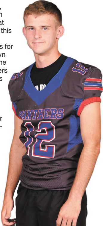
WIDE RECEIVER ELWOOD - SENIOR