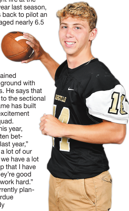
QUARTERBACK MADISON-GRANT - SENIOR