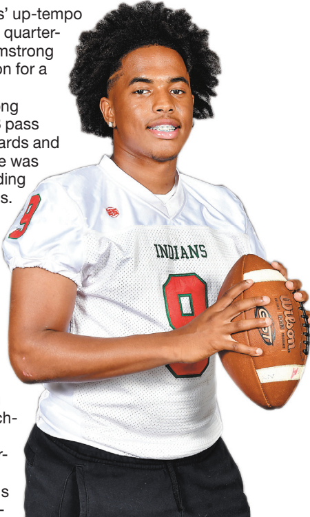
QUARTERBACK ANDERSON - SENIOR