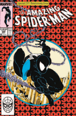
"The Amazing Spider-Man" Issue 300 (May 1989)

In the comics, Eddie Brock is 6-foot-3 and has strawberry blond hair. However, in the film, Brock (played by Tom Hardy) is 5-foot-9 with dark brown hair.