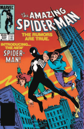
"The Amazing Spider-Man" Issue 252 (May 1984)

After Spider-Man, the symbiote latched onto Eddie Brock, a disgraced newspaper reporter exposed by Peter Parker. Their shared hatred of Parker gave rise to Venom.