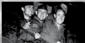
"New York City celebrating the surrender of Japan. They threw anything and kissed anybody in Times Square." Lt. Victor Jorgensen, Aug. 14, 1945