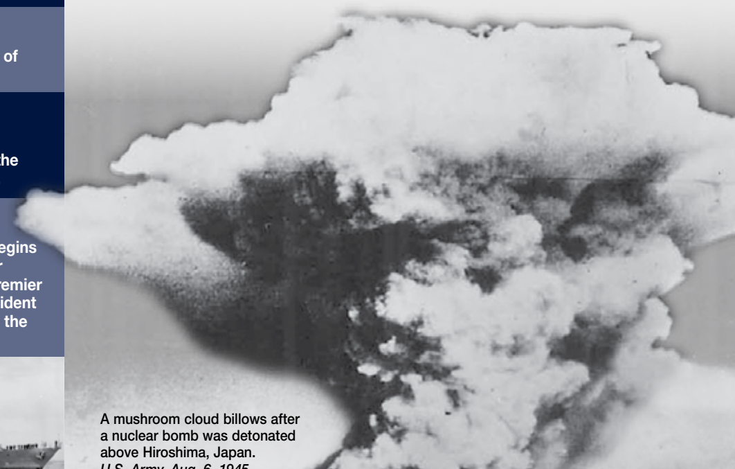
A mushroom cloud billows after a nuclear bomb was detonated above Hiroshima, Japan. Aug. 6, 1945

The Potsdam Conference begins under British Prime Minister Winston Churchill, Soviet Premier Joseph Stalin and U.S. President Harry Truman, all calling for the surrender of Japan.