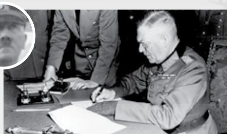
Field Marshal Wilhelm Keitel signs the ratified surrender terms for the German Army at Russian Headquarters in Berlin.

Victory in Europe Day as the ceasefire takes effect.