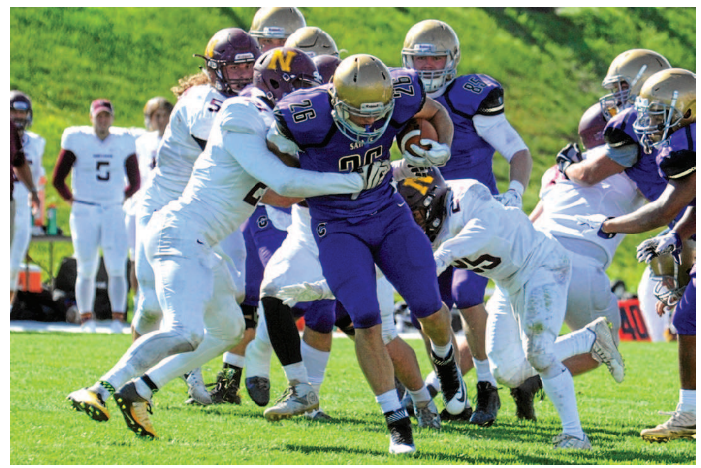
Troy Shockley, 406mtsports.com

Carroll's Ryan Walsh breaks through the MSU-Northern line for a big gain in the Saints' 34-3 win in September.