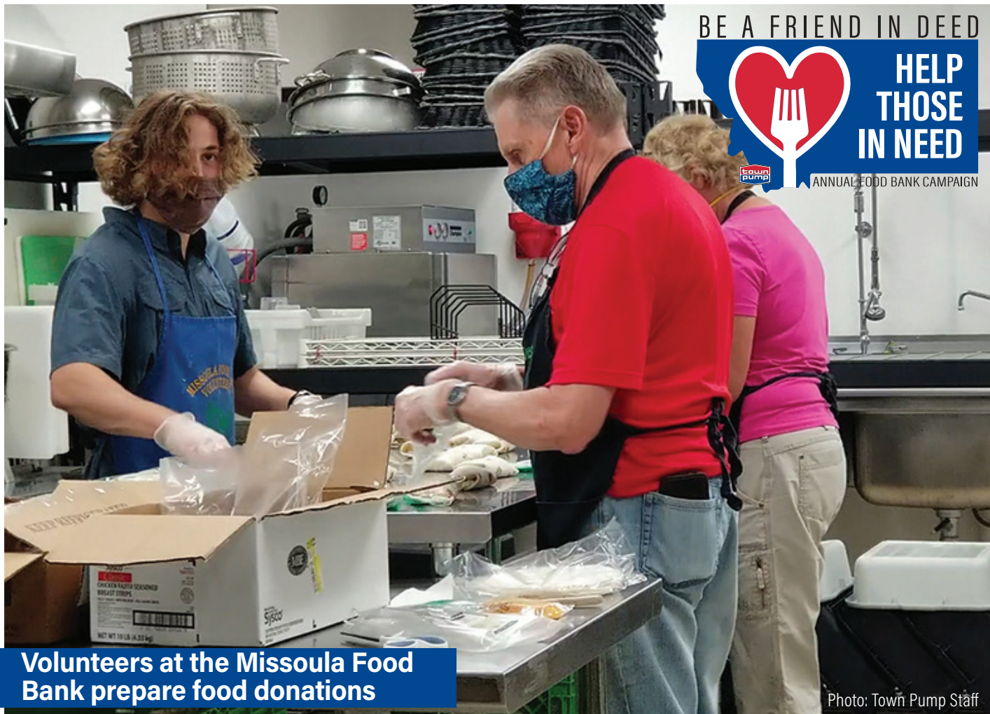
Volunteers at the Missoula Food Bank prepare food donations

Working with 98 Montana food banks, the Town Pump Charitable Foundation provided matching grants totaling $780,000. In addition, $410,000 was donated by Town Pump's generous customers at Town Pump stores, casinos, and hotels. All funds raised, including matching funds, are used in the community where the funds were collected.