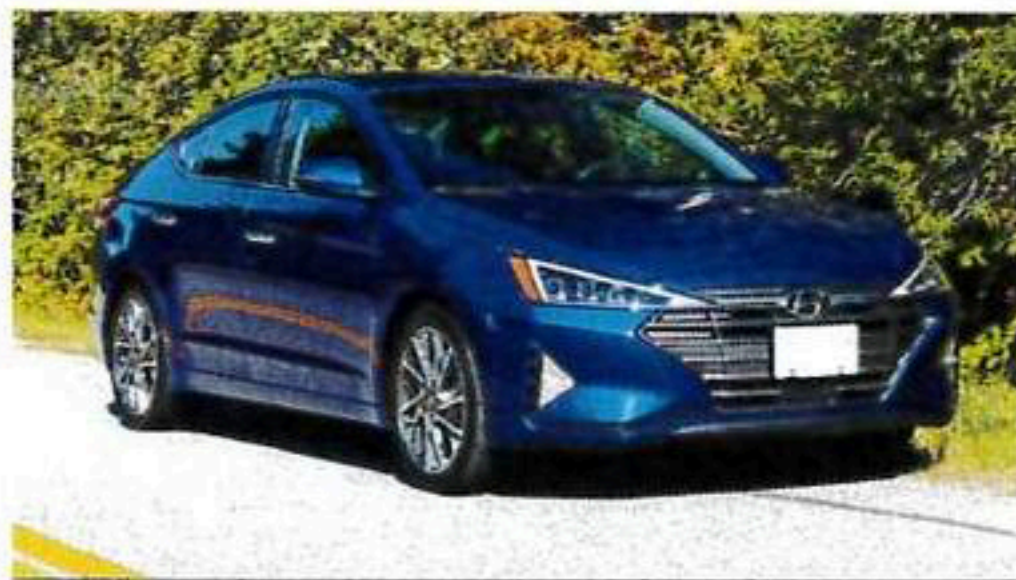
2019 Hyundai Elantra *Not actual vehicle