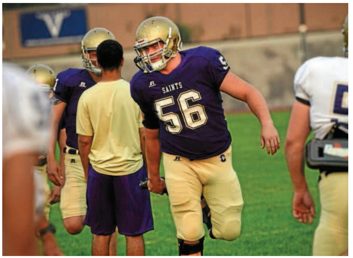
Thom Bridge, 406mtsports.com