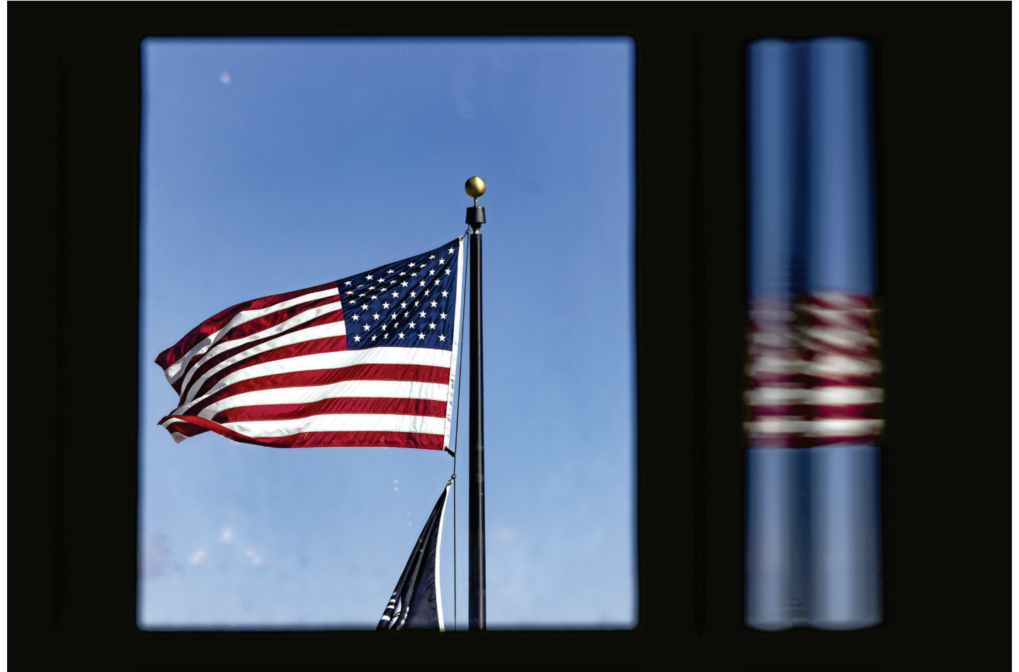
The American Flag is seen through the front window of the Montana State Capitol on April 18.

3. As your U.S. Senator, I would fight to lower health care costs for Montanans with these targeted, practical policies—no big-government overhauls or new entitlements. Increase rural Medicare/Medicaid reimbursements to fair levels that reflect Montana's high costs and low patient volumes, preventing rural hospital and clinic closures. Expand workforce incentives like loan repayment, scholarships, and visa reforms to recruit and keep doctors, nurses, and specialists in rural and tribal areas. Make telehealth permanent and affordable, backed by rural broadband investment, so patients get specialist care without long drives. Cut federal red tape