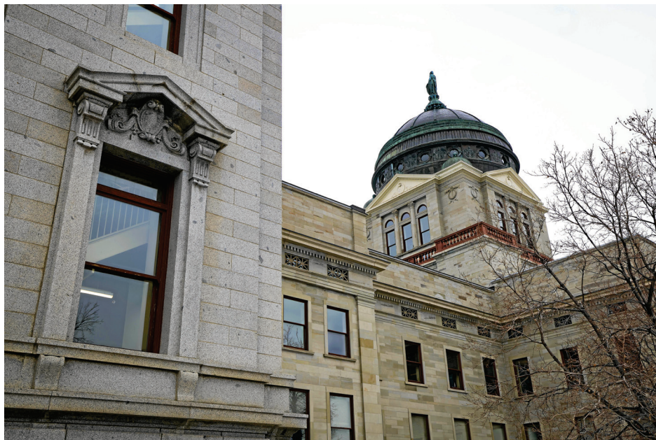
THOM BRIDGE, INDEPENDENT RECORD

5. Support for a statewide sales tax, as a stand alone measure, does not have a great deal of support in Montana. Without significantly reducing or completely eliminating another source of state government revenue, like property or income tax, I would not support a statewide sales tax. Unfortunately, Montana already has