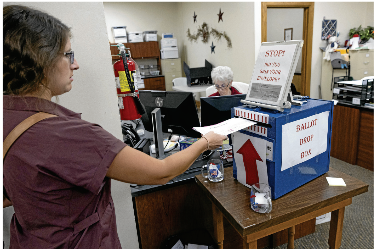
THOM BRIDGE, INDEPENDENT RECORD

1. The same squeeze hollowing out the American middle class is hollowing out Montana agriculture. The generations before us didn't build this state just so our way of life could be lost to monopolies who control both sides of the market. Farmers and ranchers are surrounded by price-fixing