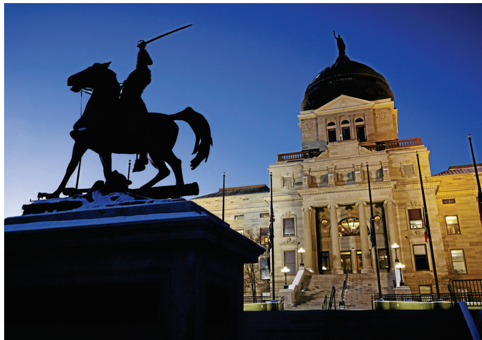
THOM BRIDGE, INDEPENDENT RECORD

2. Montana land is not for sale, full stop. I would vote against any legislation that would see the federal government sell public land