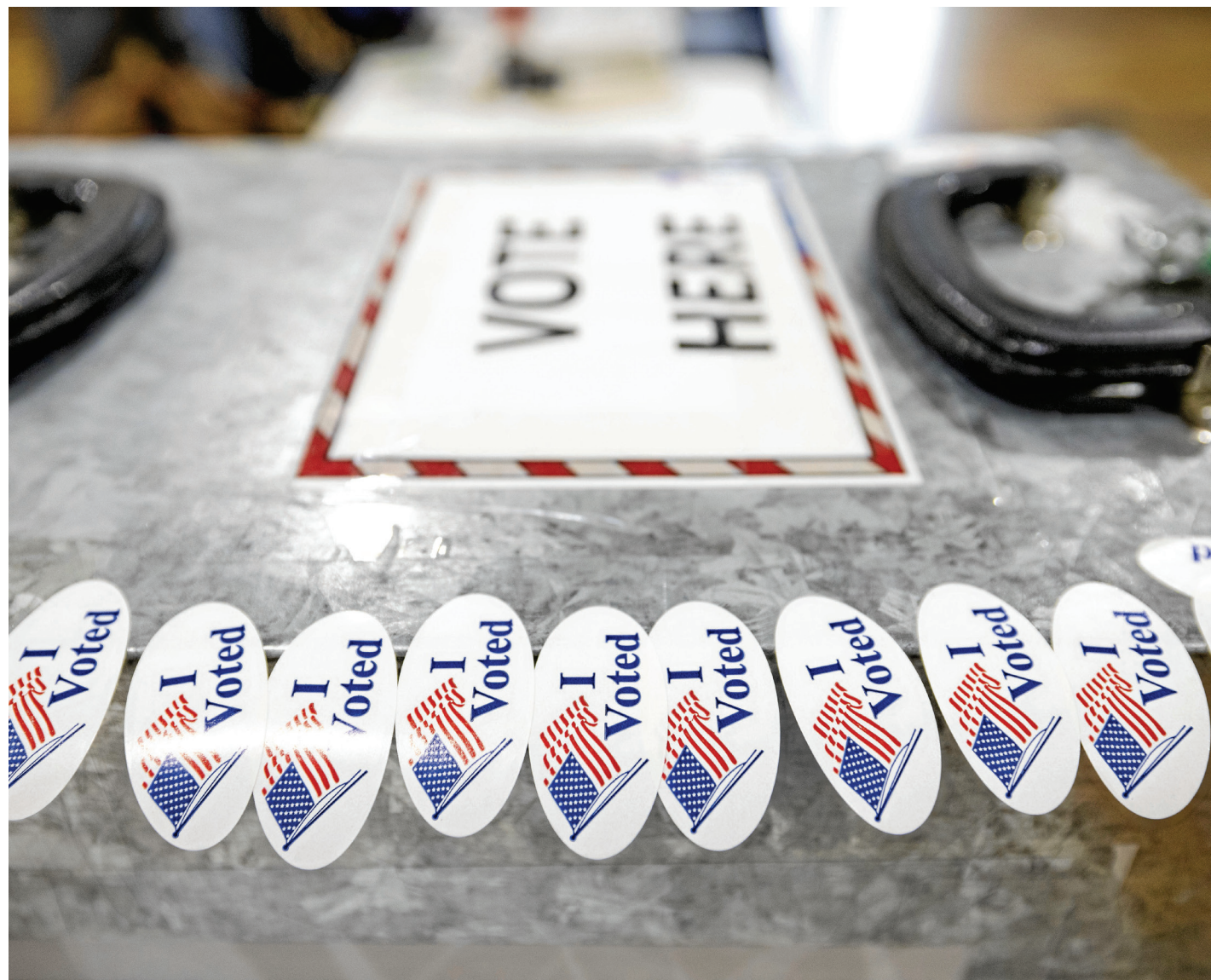
THOM BRIDGE, INDEPENDENT RECORD

things for all people at all times. Government should focus on what is needed to create favorable conditions for economic production and safety. There is still money to be saved by spending smarter, deferring projects that can wait until we can afford them, and not buying into gold plated solutions.