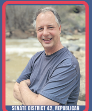
SENATE DISTRICT 42, REPUBLICAN