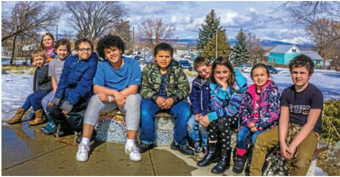
Helena students who have benefited from the Angel Fund.

Each year during the holiday season, I am reminded how generously the Helena community helps those children in our public schools with their compassion, kindness and financial support! Angel Fund is a nonprofit 501(c)(3) Corporation making a difference for children in need. Angel Fund began 30 years ago at one school helping a few students with winter coats and field trip fees. This little nonprofit has currently helped (this fall) almost 800 students with school clothes, shoes, winter outerwear, supplies and other varied school items needed to be successful in the classroom! We are honored to be a part of their "success story" each year changing lives for the better! Angel Fund also awards Montana post-secondary scholarships to qualifying seniors at Access to Success, CHS, HHS and PAL based on financial need, academic success and a commitment to "pay it forward." Along with our generous sponsors, Angel Fund awarded 25 graduates a Montana $1,000-$2,000 Scholarship this fall so they can begin a new chapter in higher education towards a brighter future! "Stuff the Bus" is an annual school supply drive coordinated by Angel Fund whereby local churches, businesses state agencies and Helena citizens