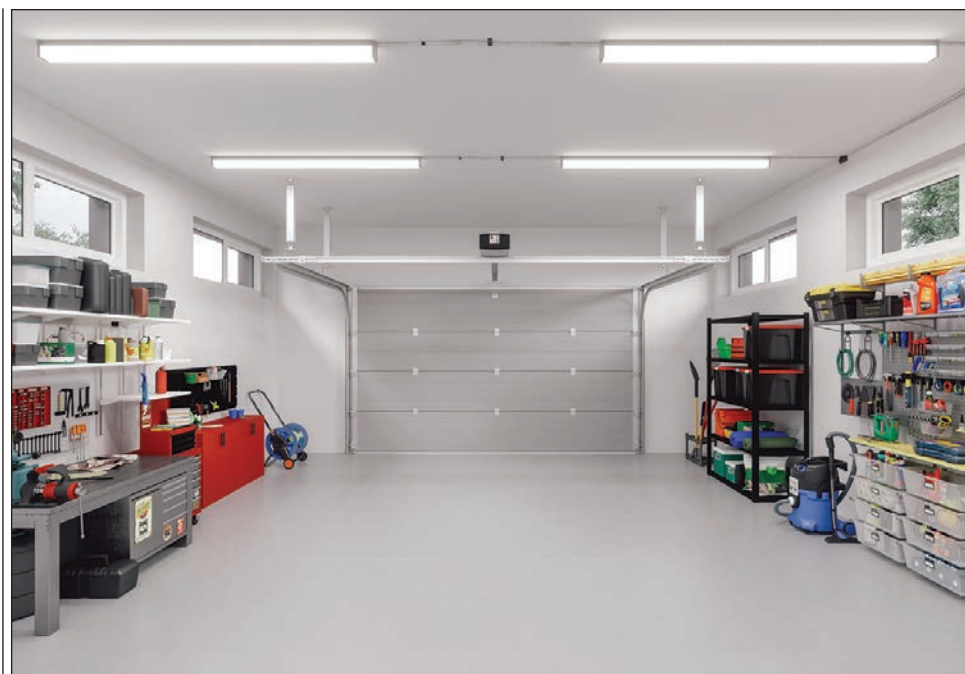
Garage organization will take some planning and time, but the end result can be well worth the effort.