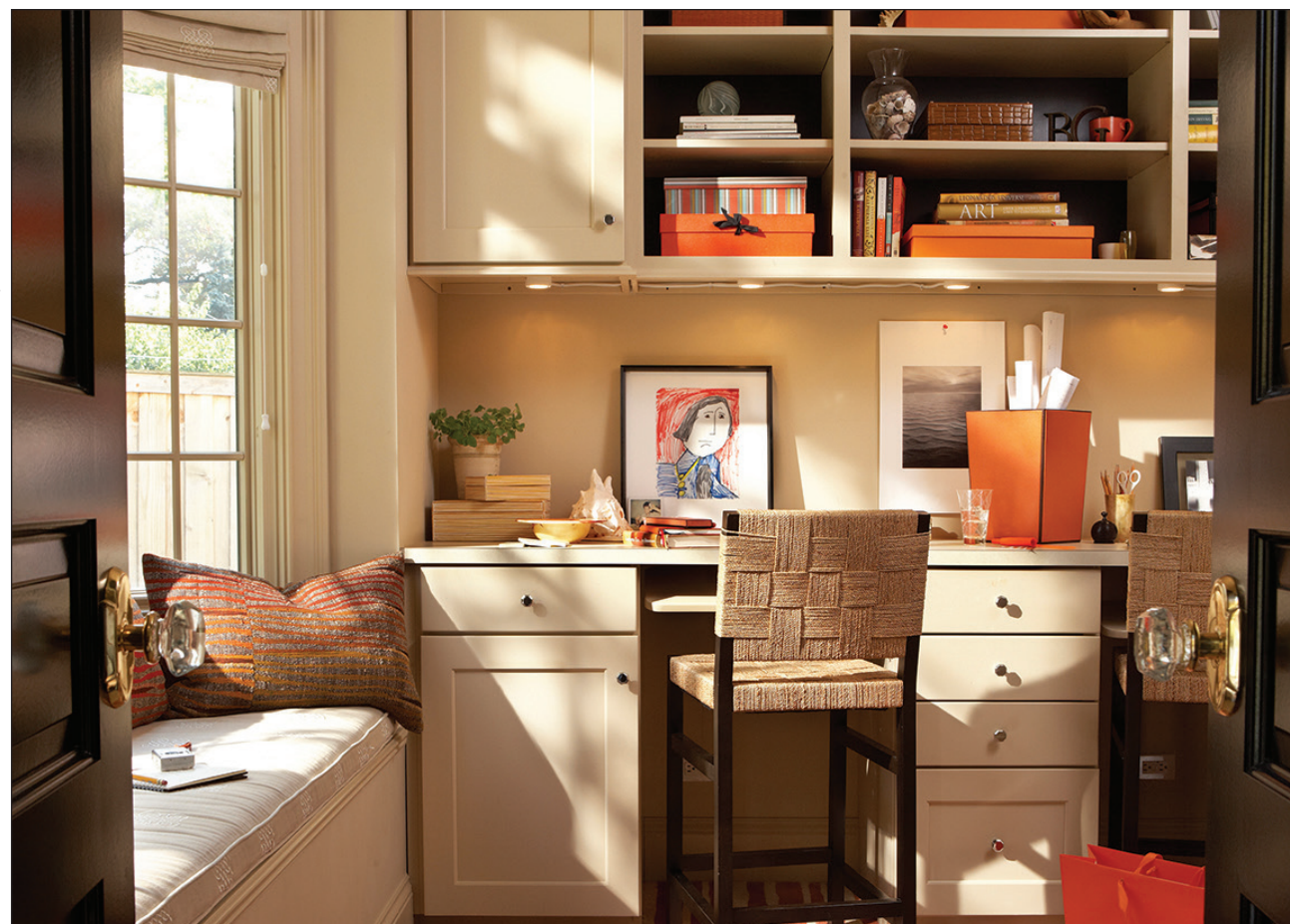
Home offices can quickly become overwhelmed with clutter. Some simple strategies can help any professional transform their home offices into more organized spaces.

• Go digital. If space is limited, forgo traditional file cabinets in favor of digitizing important records and documents. Scan important receipts and statements and store them on a desktop or backup hard drive so they're never out of each. This creates space and makes it easier and quicker to find important files.