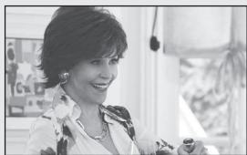
Jane Fonda stars in "Book Club"

When her husband leaves her for another woman on the same day that they send their daughter Maddie (Gordon) off to college, Deanna (McCarthy) decides to go back to school herself to finish the degree that she abandoned when she got pregnant years before. Despite being old enough to be the other students' mother, she quickly fits in and finds that though it isn't without its challenges for an older student, college is even better the second time around. Director: Ben Falcone. Stars: Melissa McCarthy, Matt Walsh, Molly Gordon, Maya Rudolph. 2018. 105 min. Comedy.