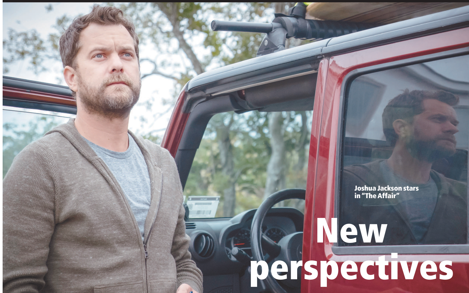
Joshua Jackson stars in "The Affair"