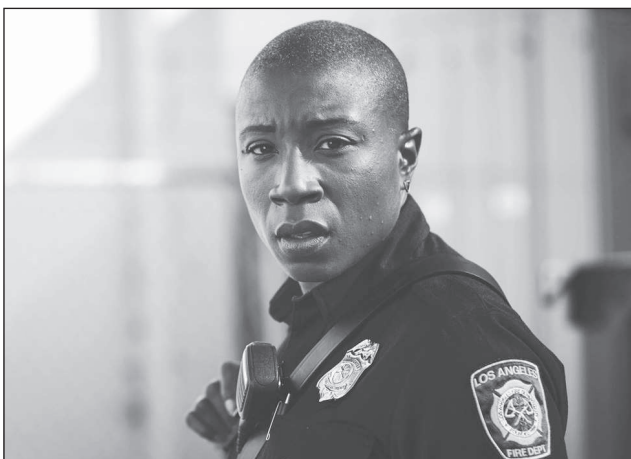
Aisha Hinds as seen in "9-1-1"

Bringing those moments to the small screen may be a big challenge, but if there's currently a team in network television that can pull it off it's this one. Murphy and Falchuk's combined credits include Fox's smash-hit musical series "Glee" and FX's horror anthology series "American Horror Story." "9-1-1" marks the pair's third straight-to-sea-