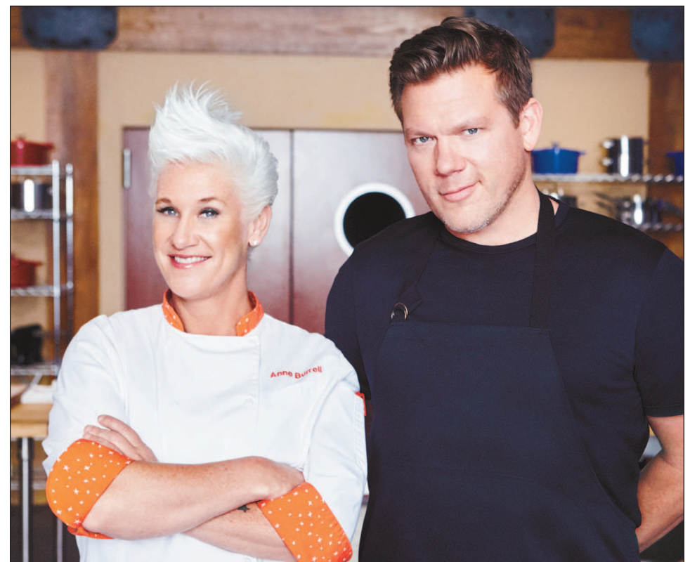
Anne Burrell and Tyler Florence host "Worst Cooks in America"

Can chef Tyler Florence finally knock chef Anne Burrell off her culinary throne? "Worst Cooks in America" returns on Sunday, Jan. 7, on Food Network.