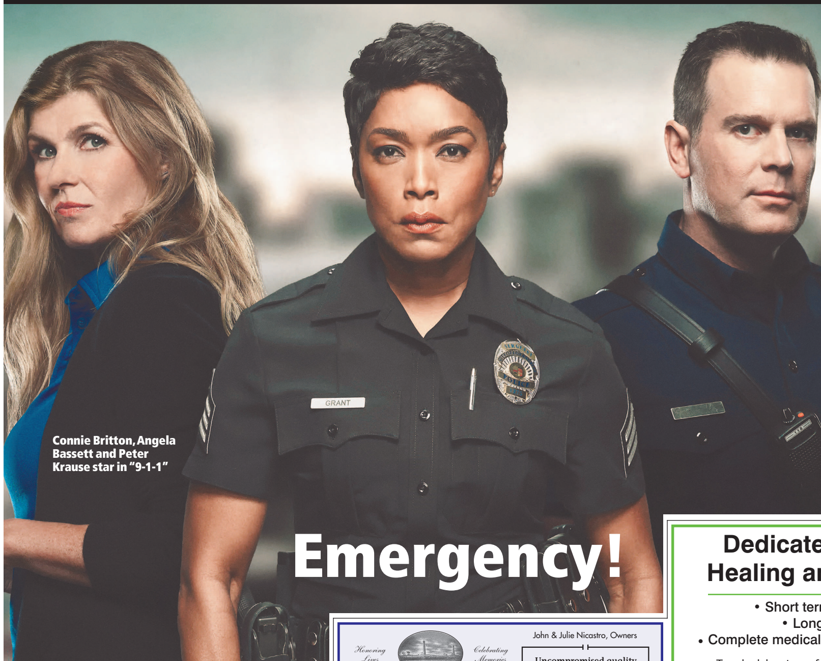
Connie Britton, Angela Bassett and Peter Krause star in "9-1-1"

Your Weekly Guide to TV Entertainment • For the week of January 6 - 12, 2018 •