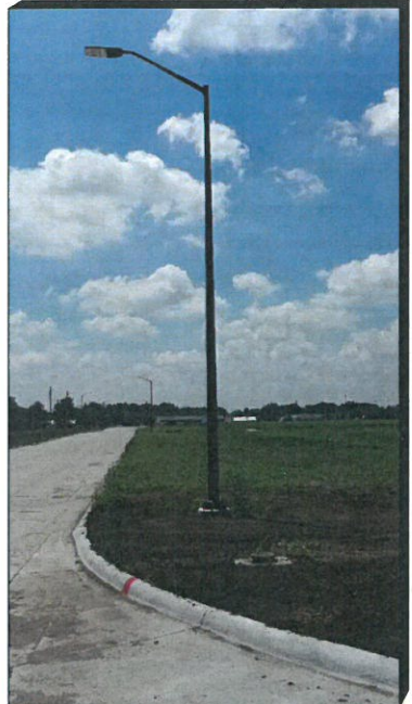
NEW STREET LIGHTS TO BE INSTALLED TO MATCH NORTH 32ND STREET

CONSTRUCTION COST ESTIMATE FOR 9 NEW STREET LIGHTS AND ASSOCIATED WORK IS $60,000