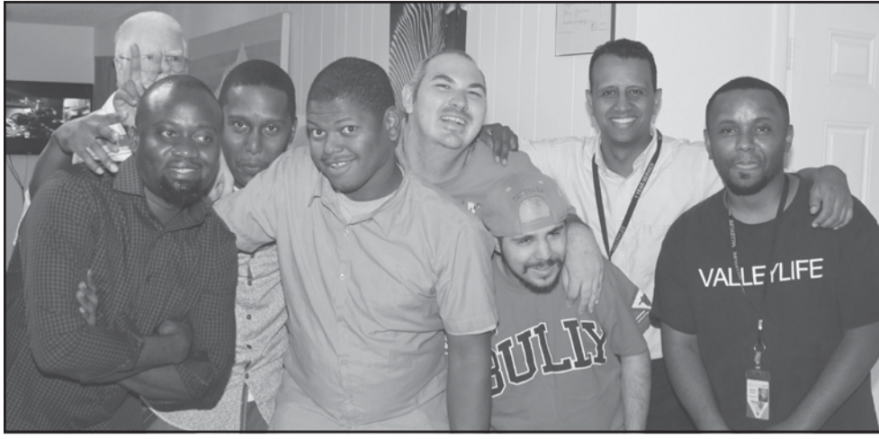
VALLEYLIFE Members and Staff from Carol group home