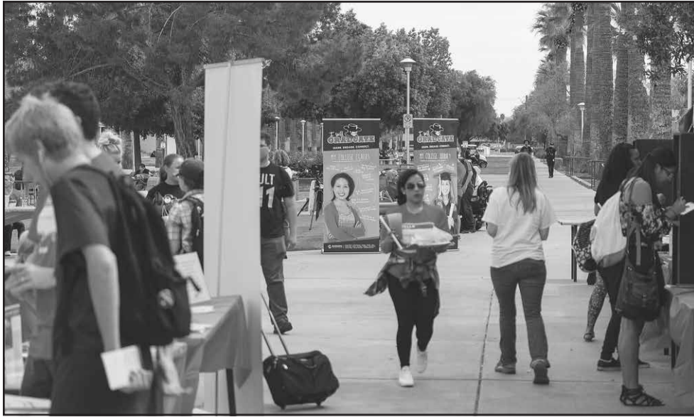
Glendale Community College students exploring and learning about campus opportunities.