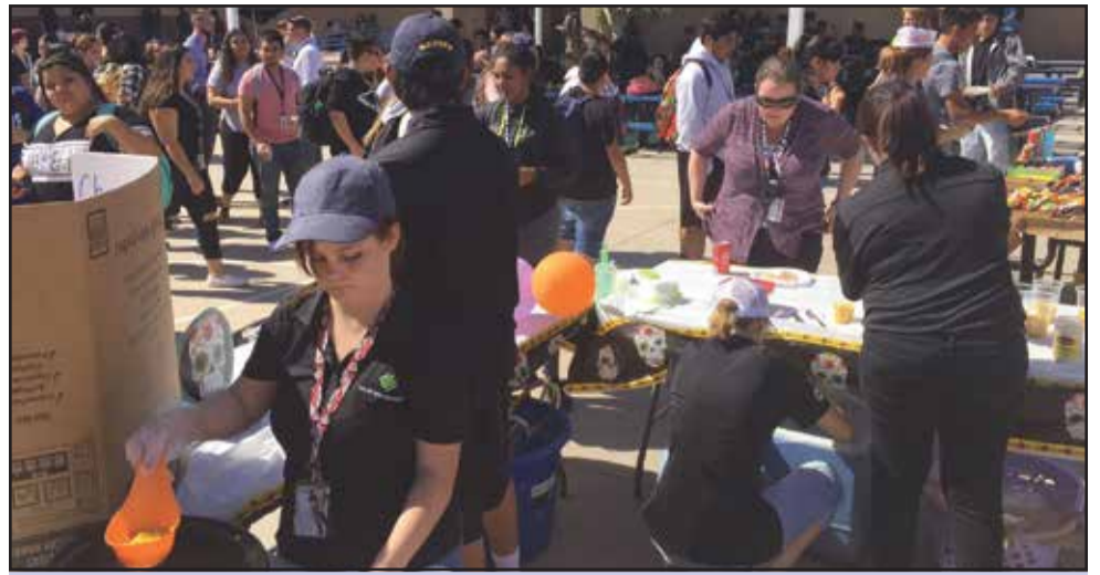
Students at Peoria Accelerated High School run businesses of their own design during the school's Market Day event.

* As we continue to harmonize the common assortment of products in both Office Depot and OfficeMax stores, you will receive your discounted/contract pricing in either store for items that are exact matches, item number and unit of measure packaging, by manufacturer. At this time, your contract pricing for our exclusive private brands and copy and print services are not available in both stores.