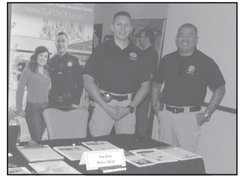
2017 Luke Base Job Fair, hosted by the Airman & Family Readiness Center

• AMVETS - Provides medical records screening and assistance with VA disability claims