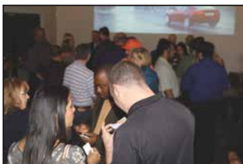
Business owners exchange contacts and referrals at a Peoria Chamber mixer

Chambers of Commerce have good reputations, and many consumers have positive perceptions of members and their businesses. In fact, you may be interested to know that accord-