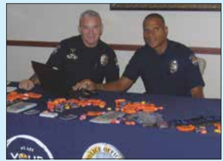
2017 Luke Base Job Fair, hosted by the Airman & Family Readiness Center

Financial Management Programs (Some of these programs available to active duty military only) • Family Readiness Programs • Relocation Readiness Programs • Exceptional Family Member Program (EFMP) is designed to provide support to military family members with special needs. EFMP Services include a variety of personnel, medical and family support functions.