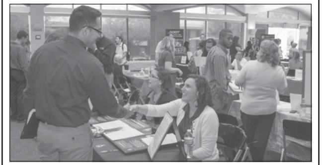
Save the Date: Glendale Community College Job Fair March 21st 9:00 am-1:00 pm

3- Need a job now or need on-line resources? Maricopa Community College's Career Services have recently launched our new career management tool, Maricopa CareerLink, www.maricopa.edu/careerlink , where individuals can easily search for and apply for jobs and internships, store and build resumes, practice interviewing, and much more.