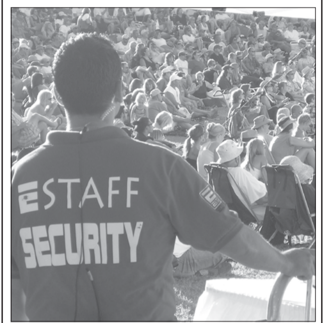
Estaff personnel on the job at an event.

Send resumes to schedule.estaff@gmail.com or estaffsecurity.com