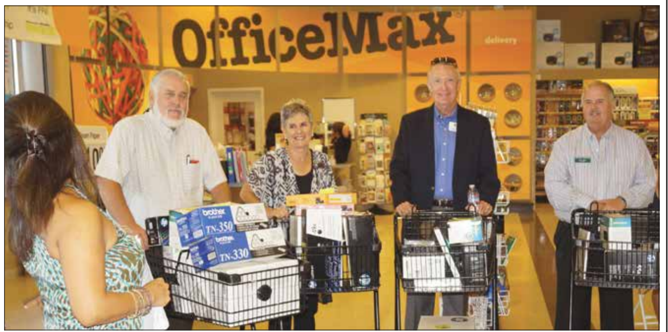
Shopping carts loaded with tons of savings thanks to our Office Depot/OfficeMax program.