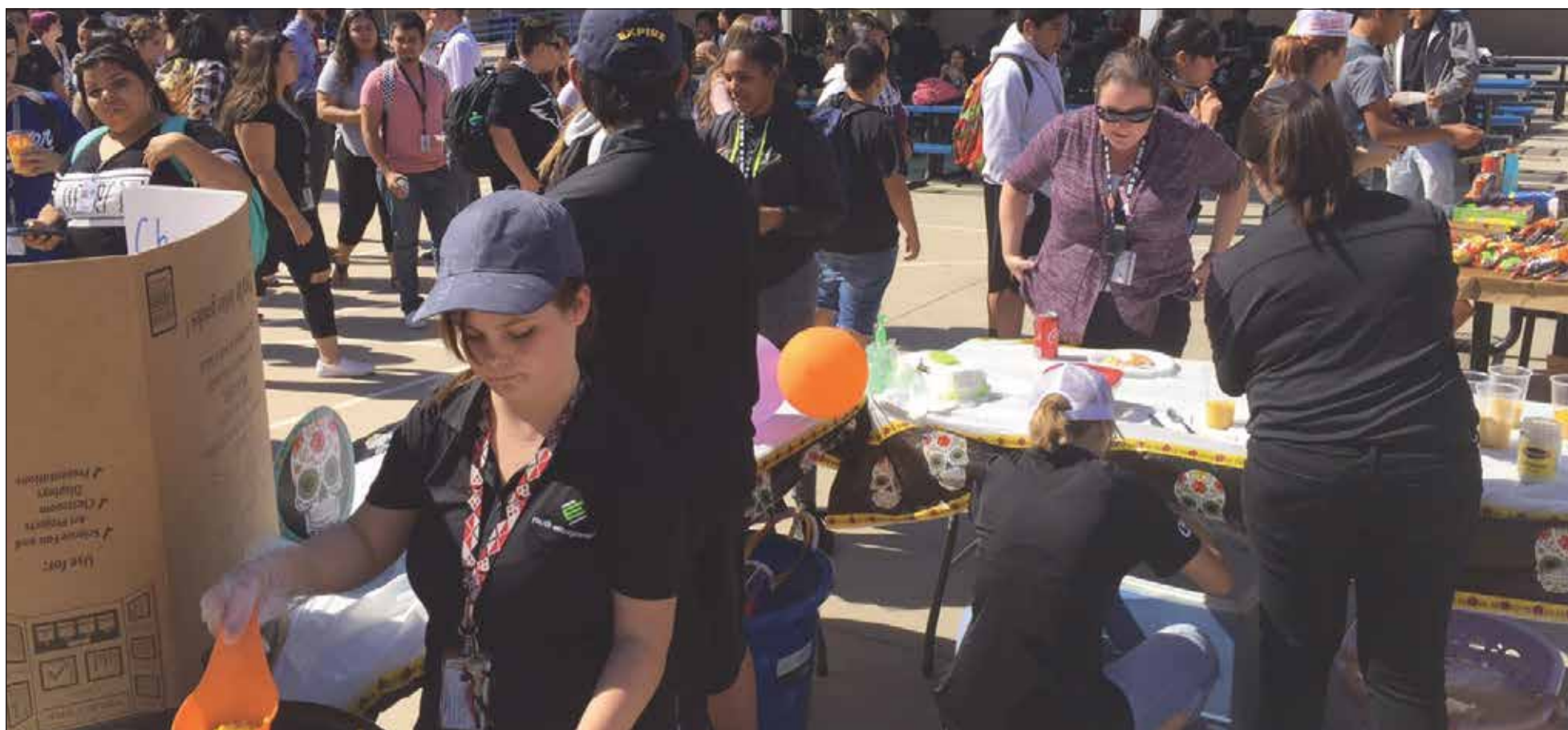
Students at Peoria Accelerated High School run businesses of their own design during the school's Market Day event.