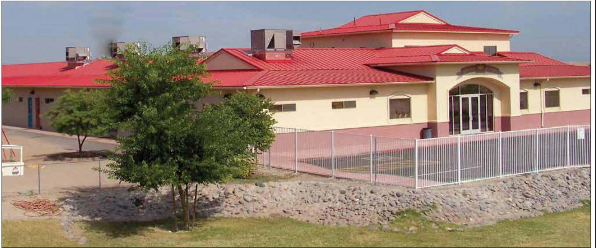
Crown Charter School "We are in the business of developing of human intelligence!"