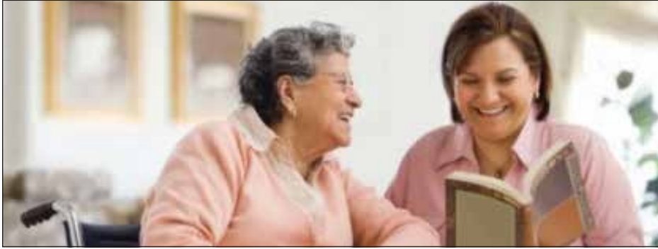
ResCare employees say they love their jobs because they can reach out to their communities and make a real difference in peoples' lives!