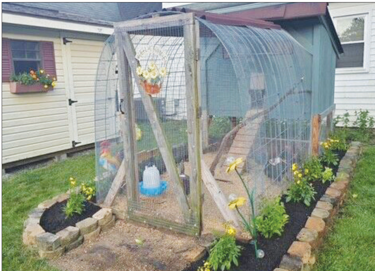
A backyard coop in Lancaster County.

The Pennsylvania Game Commission requests that any sick or dead domestic birds be reported to the Pennsylvania Department of Agriculture at 717-772-2852. Any person who has had contact with a sick or dead bird should contact their primary care physician or the Pennsylvania Department of Health at 877-724-3258.