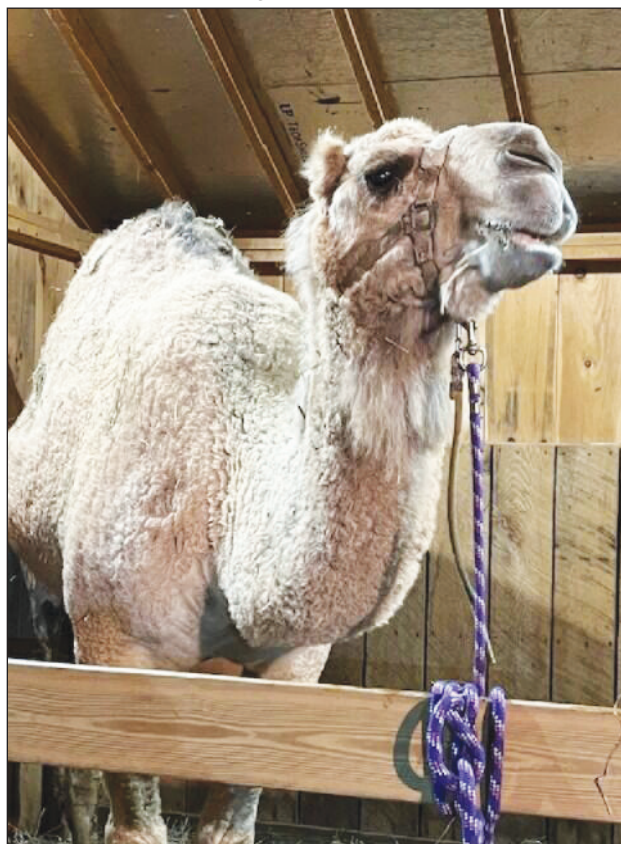
The camel, Sir Lancelot, or “Lance,” had been a part of the Mountain Top Ministries live nativity scene for many years.