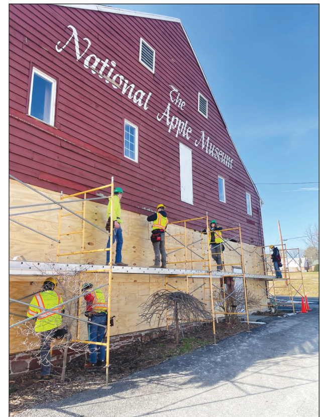
Adams County Technical Institute (ACTI) 12th-grade building trades students work from scaffolding as they install sheathing and make repairs to the east gable wall of the Ditzler Barn in Biglerville, home of the National Apple Museum.

Readers may contact Liz Caples at ecaples@gettysburgtimes.com .