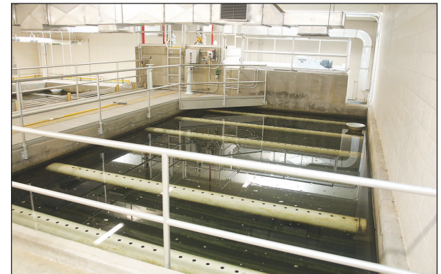
The Gettysburg Municipal Authority uses pulsator technology at the water filtration plant near Marsh Creek to enhance the water treatment process.

By then, nearly 40 states had established health departments to address issues of water safety. Standards for water quality took another