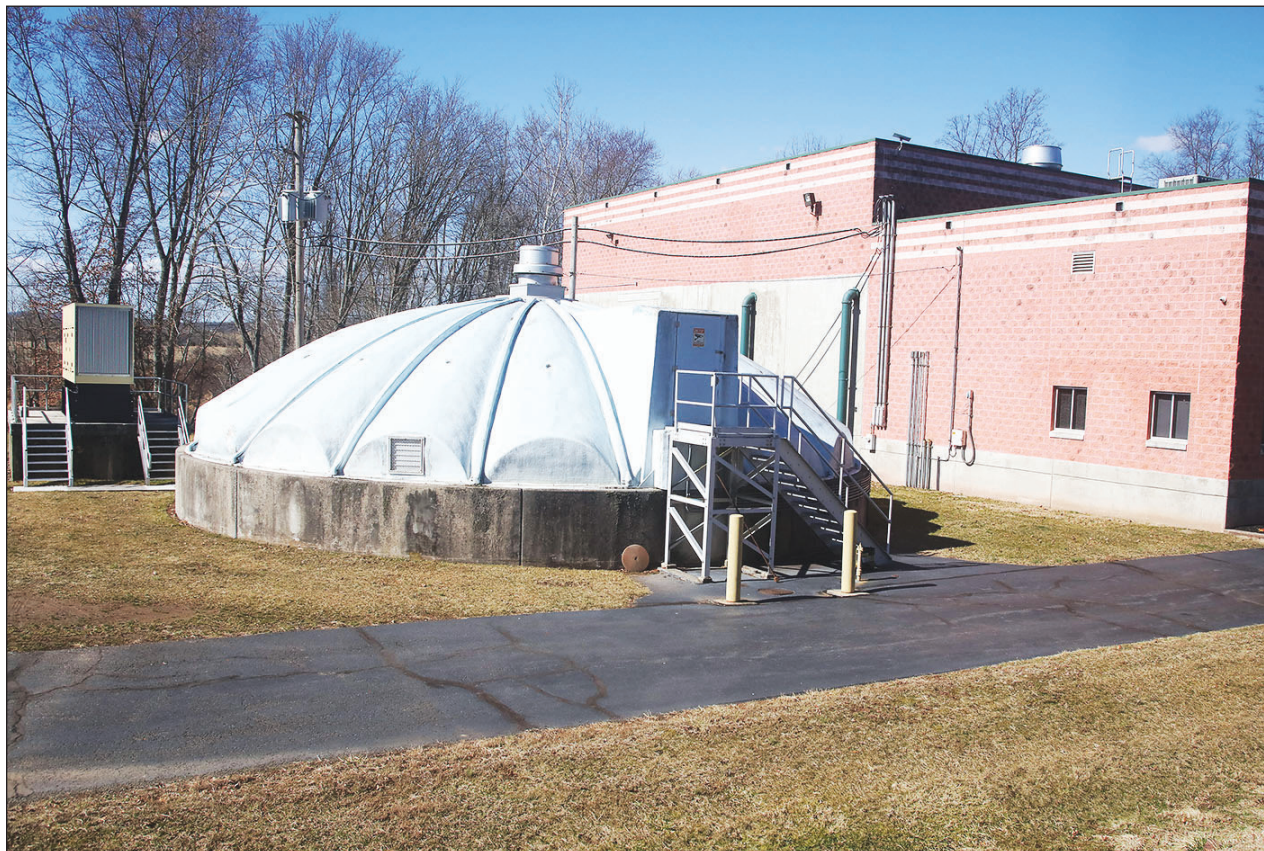
The gravity thickener at the Gettysburg water filtration plant near Marsh Creek is designed to handle filter backwash and sludge storage.

Kaslow credited the work of the Adams County Conservation District (ACCD) for promoting best practices among farmers and other area residents to keep high nutrient substances such as nitrogen and phosphorus out of the water supply. Animal waste and many household products can contain phosphorus. Residents who overfertilize contribute to high nutrient levels from runoff from their lawns, leading to problems with surface and well water sources.