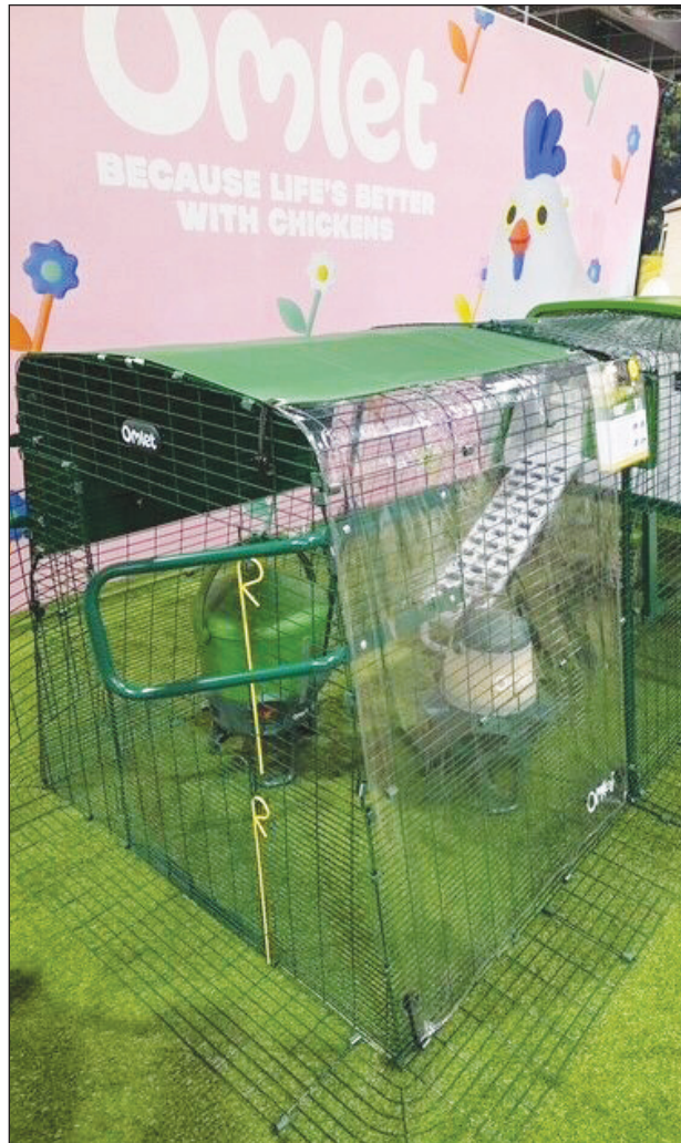
A backyard chicken coop on display at the 2026 Philadelphia Flower Show.