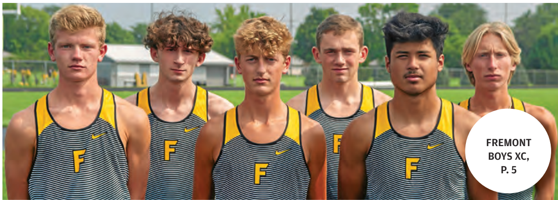
FREMONT BOYS XC, P. 5