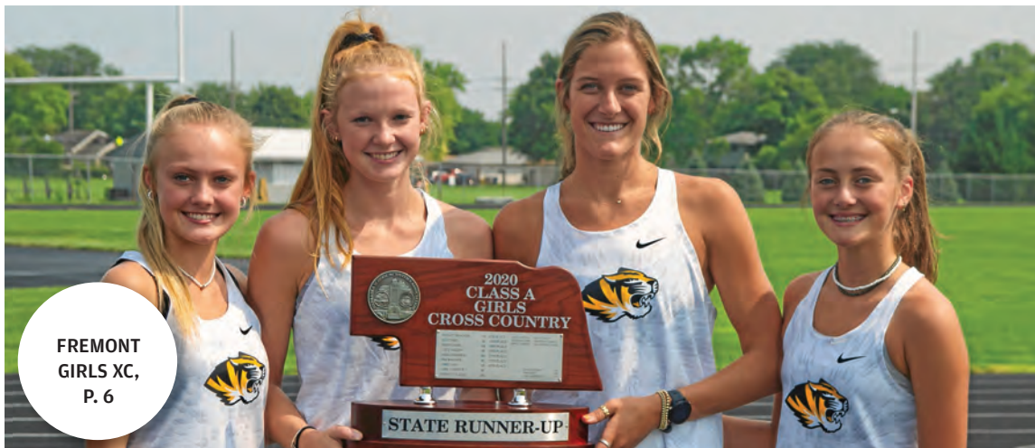
FREMONT GIRLS XC, P. 6

Despite the challenges of the 2020 season, four Fremont schools rose to the top of their sports fall, producing one state championship and three state runner-up finishes. A year later, all four are ready to make their return to the top of the mountain.