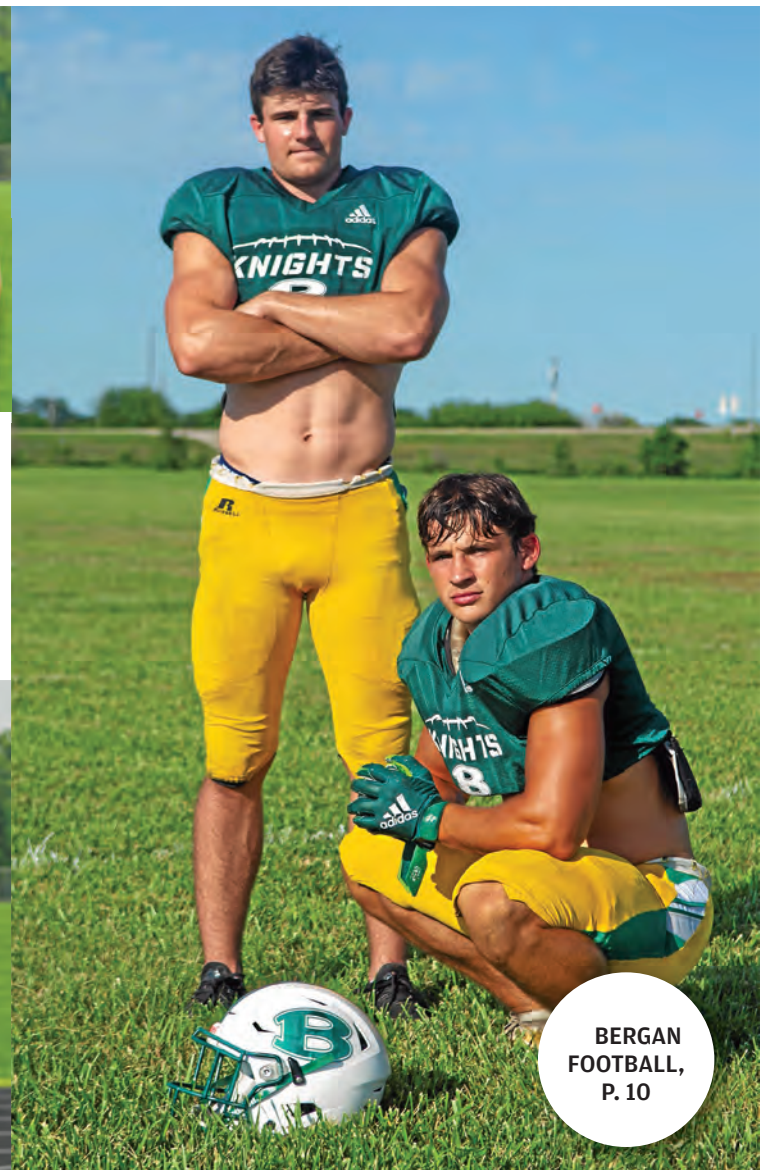
BERGAN FOOTBALL, P. 10