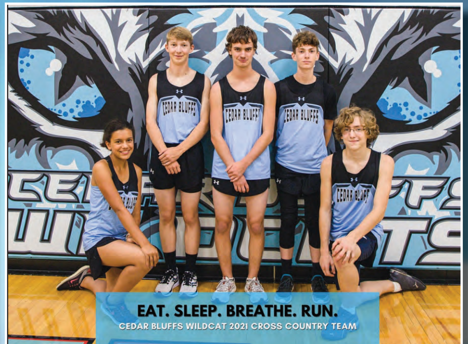
EAT. SLEEP. BREATHE. RUN. CEDAR BLUFFS WILDCAT 2021 CROSS COUNTRY TEAM