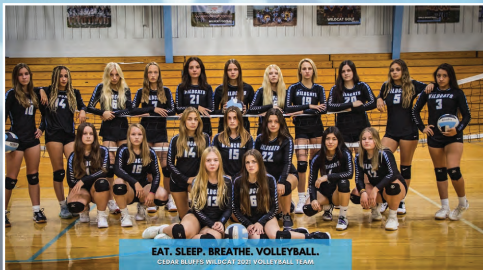
EAT. SLEEP. BREATHE. VOLLEYBALL. CEDAR BLUFFS WILDCAT 2021 VOLLEYBALL TEAM