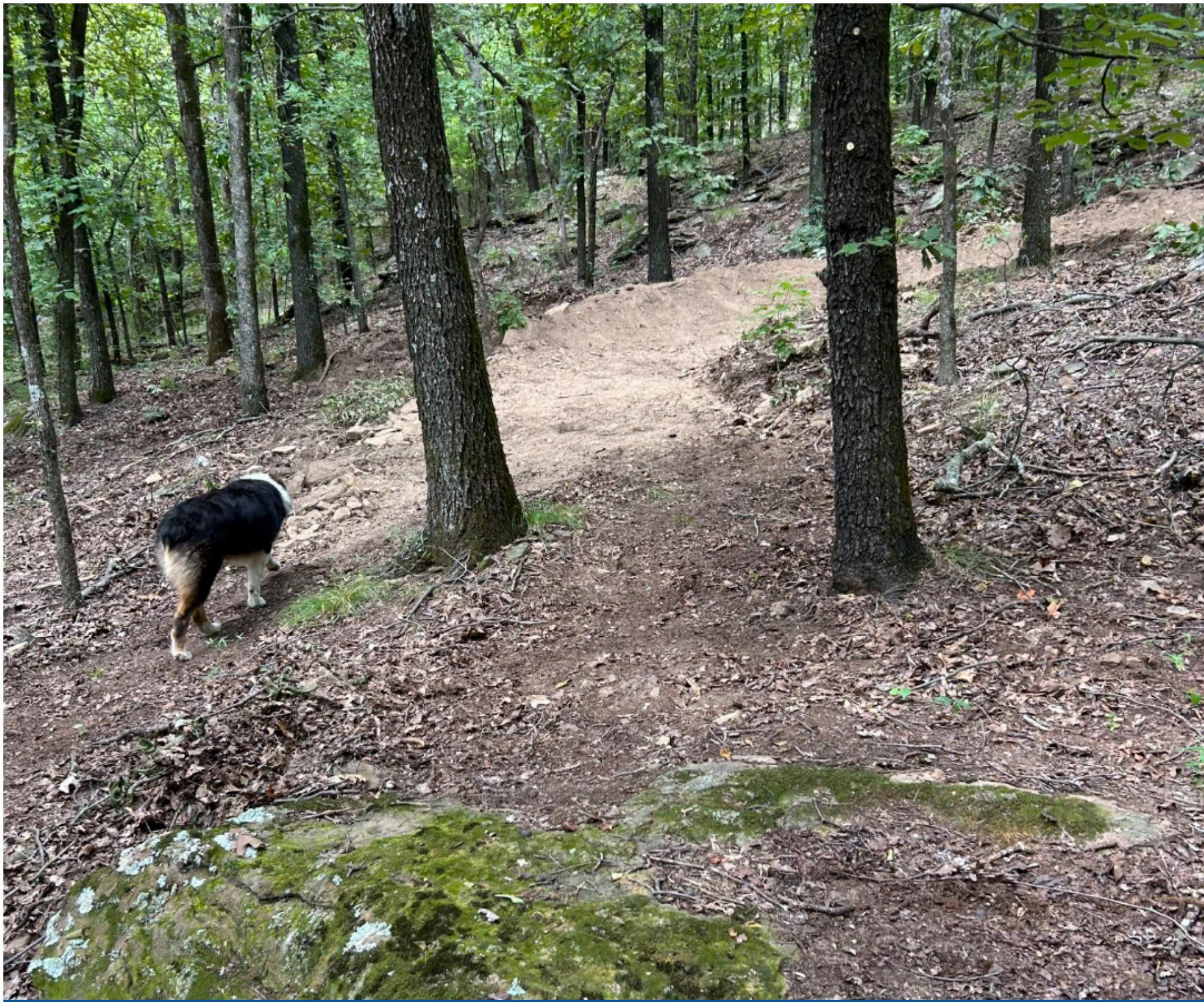
Rolling contour design resulting in gradual ascents/descents