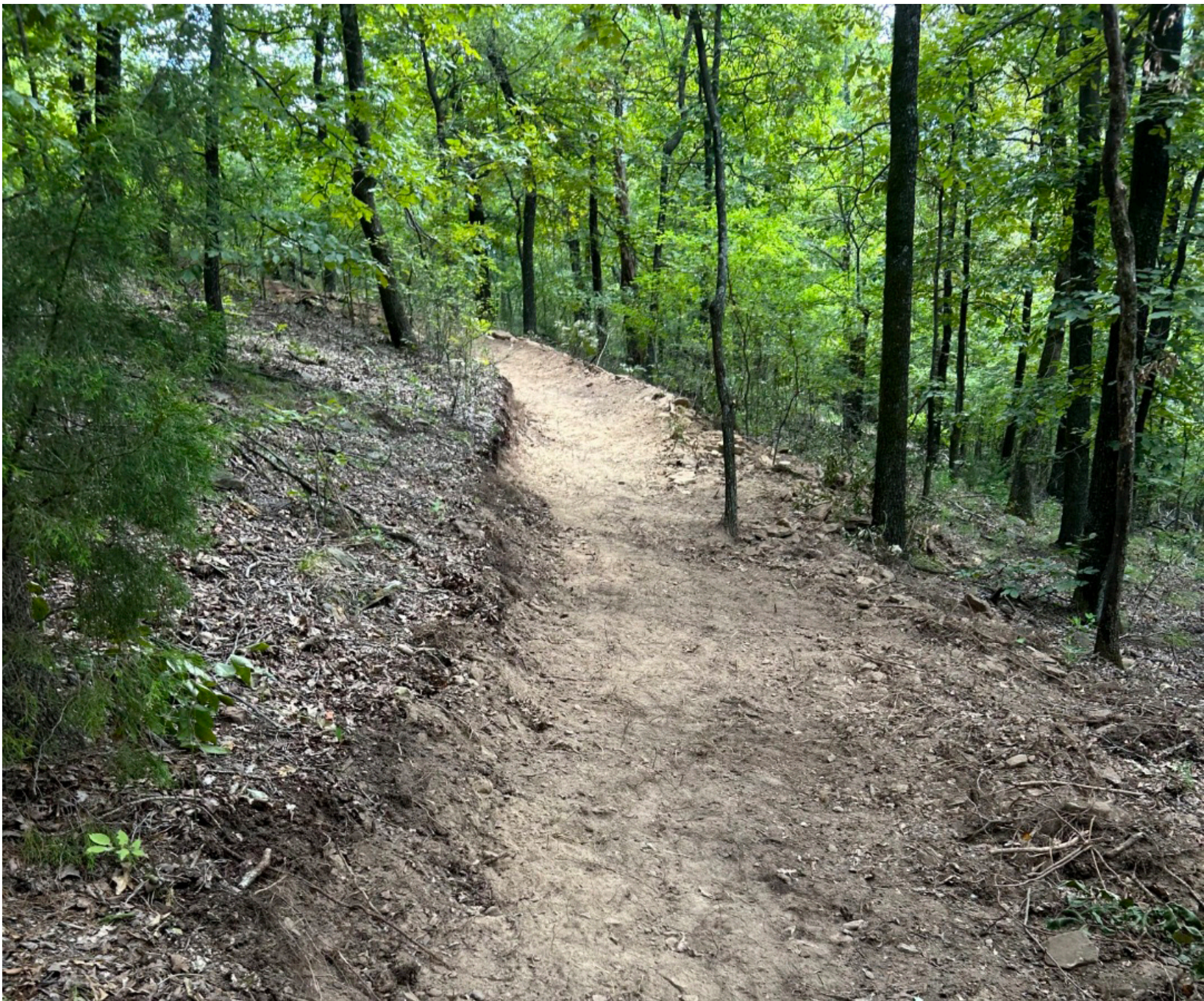
Purpose built for mountain biking, hiking and trail running