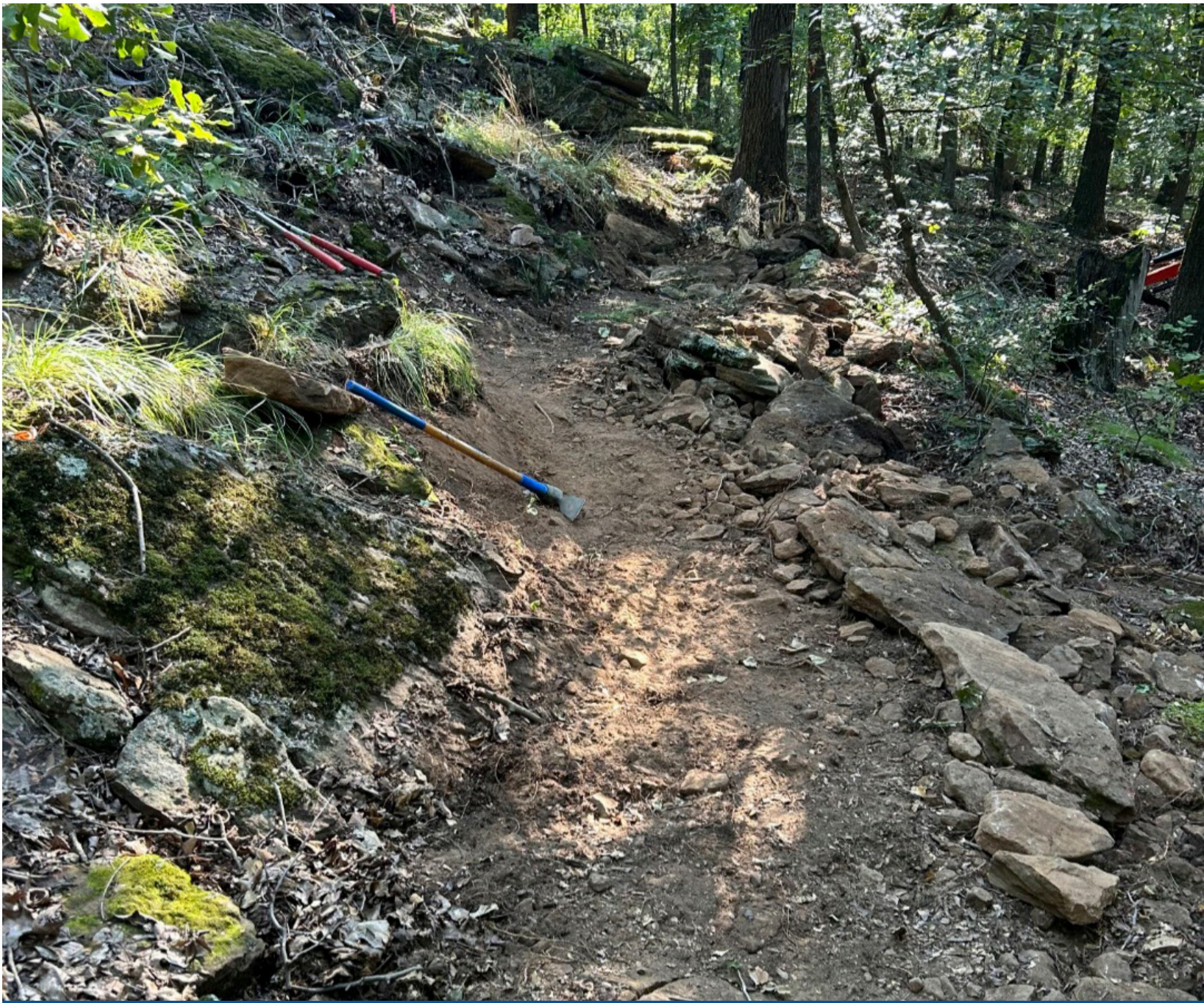
Combination of machine and hand-built trails, approximately 30" wide