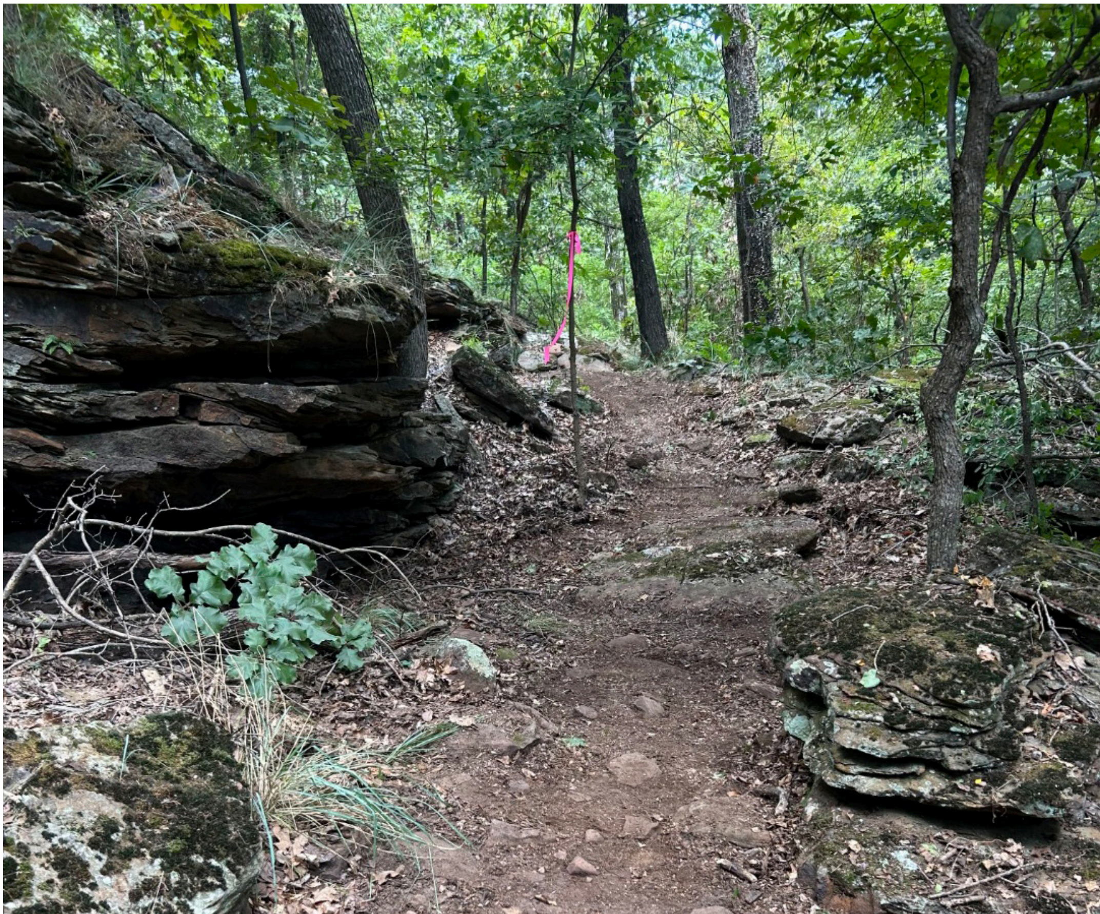
Soft surface trails using sustainable practices to mitigate erosion