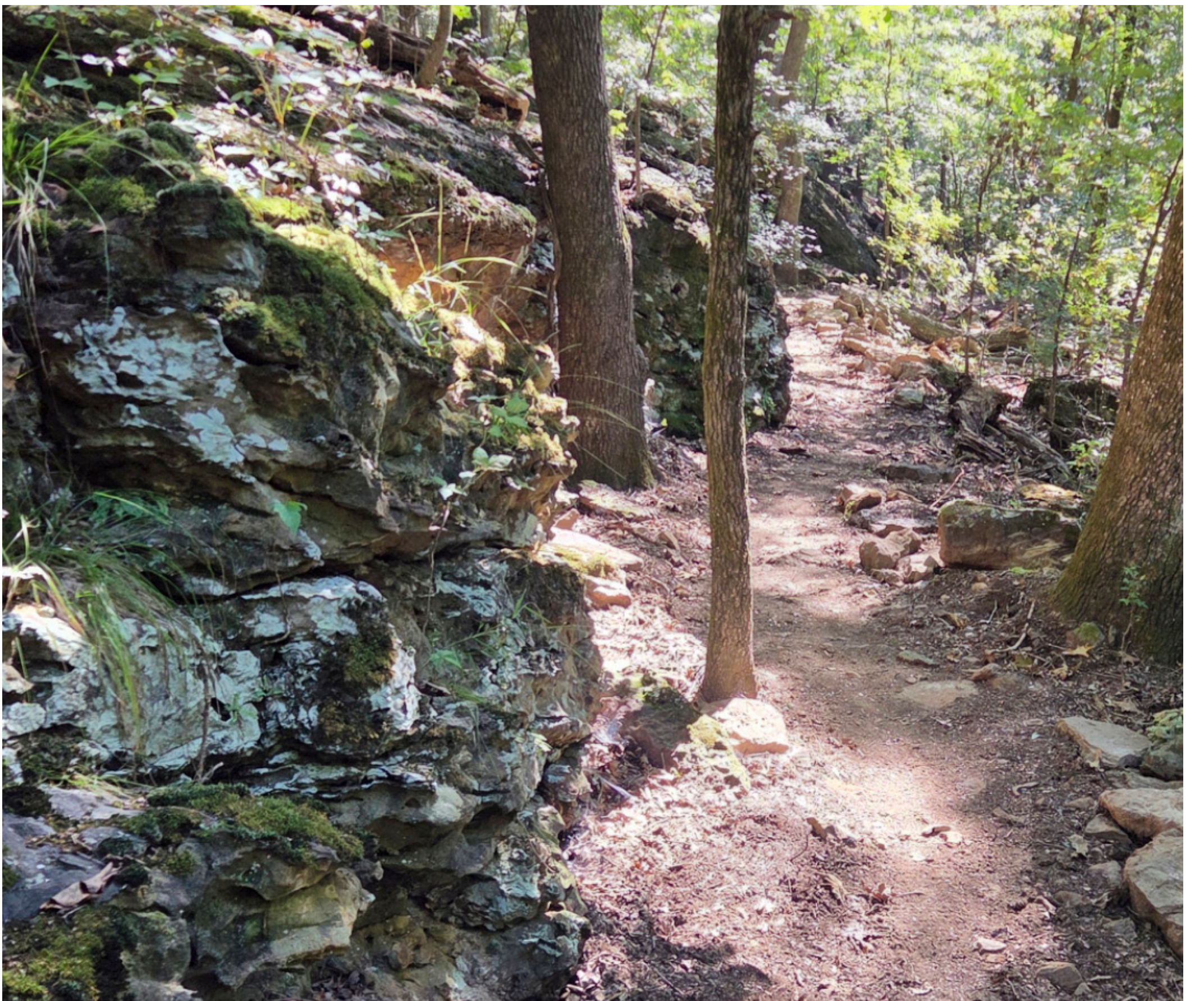
Natural rock formations incorporated to enhance user experience