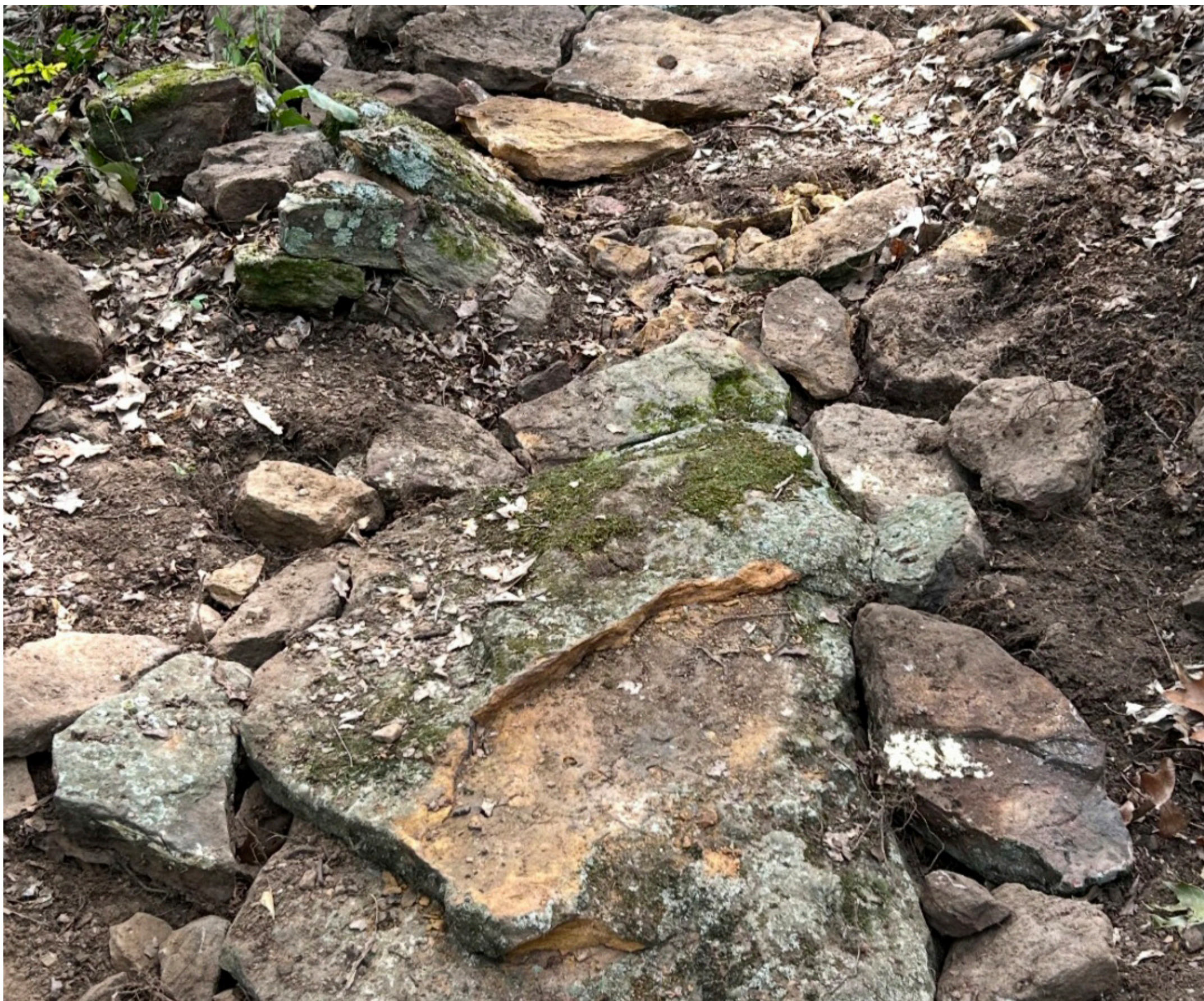
Rock reinforcement to improve drainage and trail durability