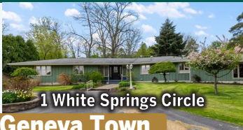
1 White Springs Circle Geneva Town