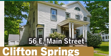
56 E. Main Street Clifton Springs