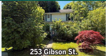
253 Gibson St. Canandaigua City