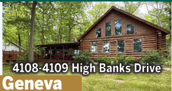
4108-4109 High Banks Drive Geneva