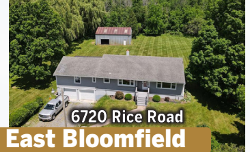
6720 Rice Road East Bloomfield