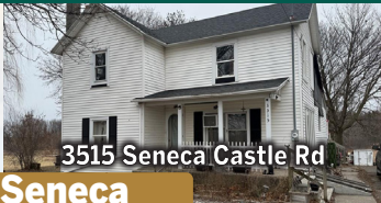
3515 Seneca Castle Rd Seneca