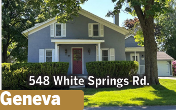
548 White Springs Rd. Geneva