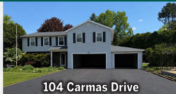
104 Carmas Drive Greece