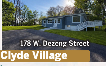
178 W. Dezens Street Clyde Village