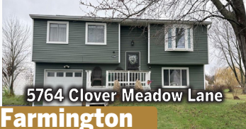
5764 Clover Meadow Lane Farmington