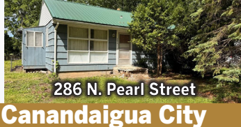
286 N. Pearl Street Canandaigua City