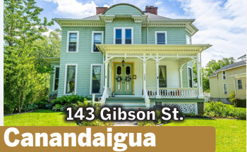
143 Gibson St. Canandaigua