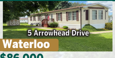
5 Arrowhead Drive Waterloo