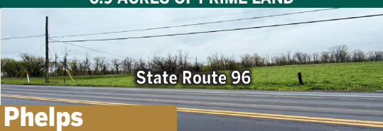
State Route 96 Phelps