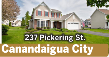
237 Pickering St. Canandaigua City