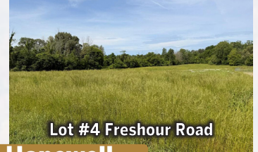
Lot #4 Freshour Road Hopewell