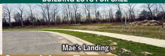
Mae's Landing Canandaigua Town