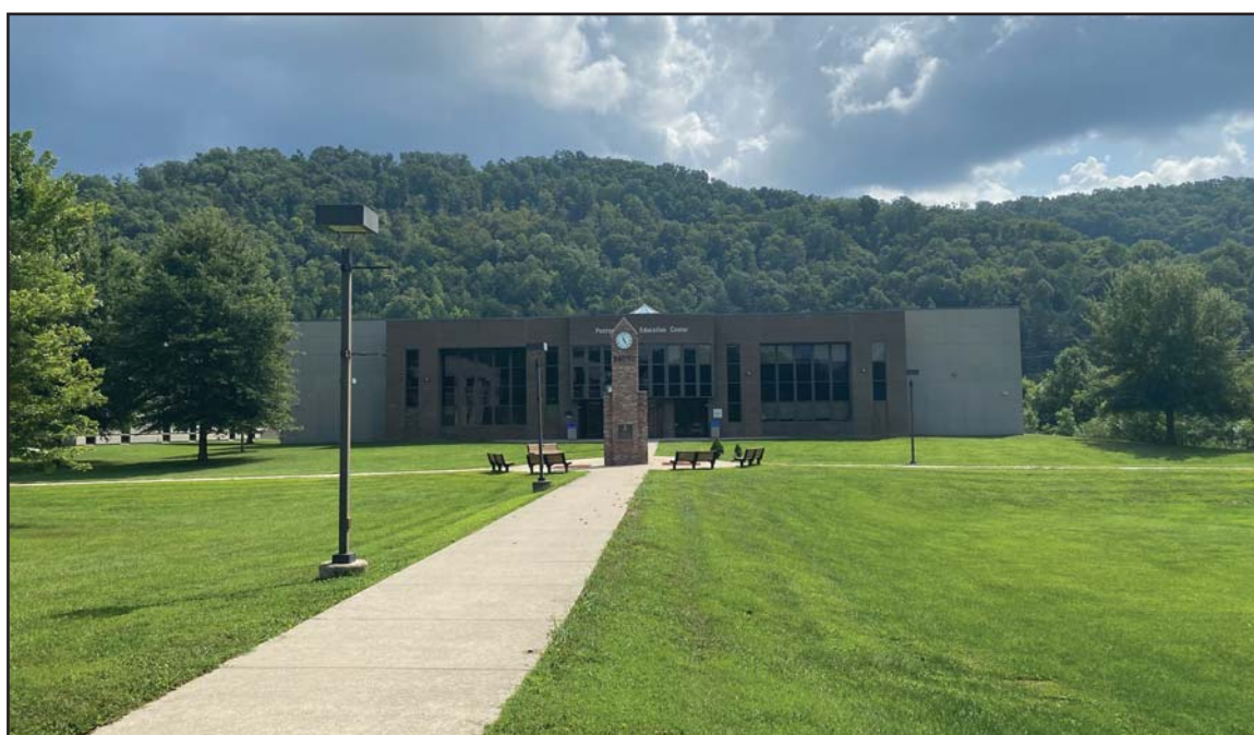
Big Sandy Community and Technical College's Prestonsburg campus is preparing to open for the fall term.