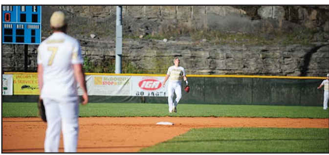
Jaguars top Pike County Central, 6-2, Sports 1B