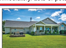
3331 Mulberry $319,900

4 BR/4 bath home. Kitchen features a large pantry & breakfast bar, LL has a good sized family room with a gas FP. 2 car garage with heated workshop.