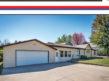
1708 Foster $219,900

Bright & open 3BR/3 bath home. Open floor plan, large kitchen, MFL and master bath. Lower level offers a huge family room and 3/4 bath.