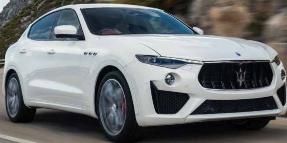
2019 Maserati Levante