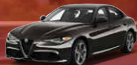
2019 Giulia Ti