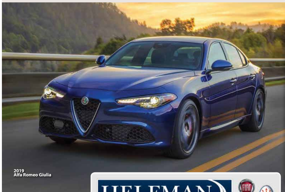
2019 Alfa Romeo Giulia