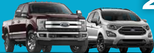
2019 F-250 King Ranch