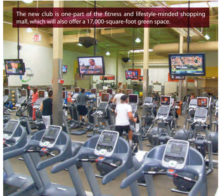
The new club is one-part of the fitness and lifestyle-minded shopping mall, which will also offer a 17,000-square-foot green space.

"Firethorne residents place high-value on community and fitness in their daily lives and we are thrilled