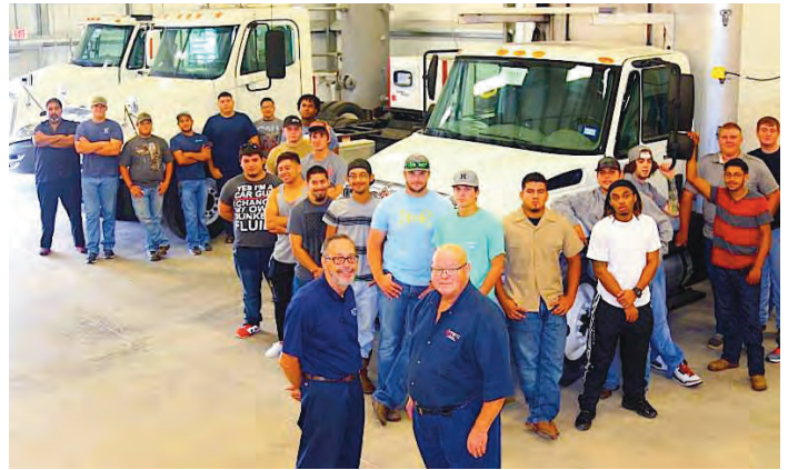
TSTC in Fort Bend County Diesel Equipment Technology instructors and students stand with the four diesel trucks provided by Kyrish Truck Center for their class lab.