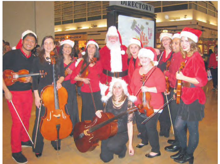
Members of the entertaining String Theory String Orchestra are gearing up for their Dec. 12 concert at Bob Lutts Library.

String Theory String Orchestra was founded in the summer of 2012 by a group of individuals who love to play chamber music and who wanted to explore the abundance of great string music this is often missed if one performs solely with a symphony orchestra.