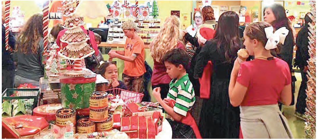
Youngsters will enjoy the special children's area, featuring all kinds of holiday goodies.