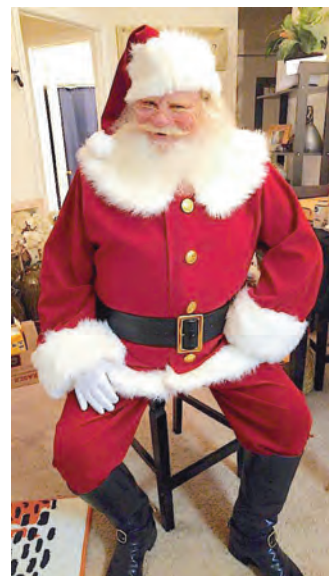
Old Saint Nick himself will be front and center when the Fulshear community celebrates a 'Holly Jolly Christmas.'

"We hope it's an exciting time. We put a lot of effort and work into pulling things together behind the scenes. We try to create a family-friendly environment. People will drive miles for a good event. Word has spread. We try to create a Class A