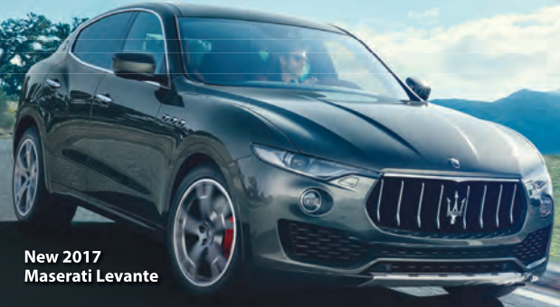
New 2017 Maserati Levante