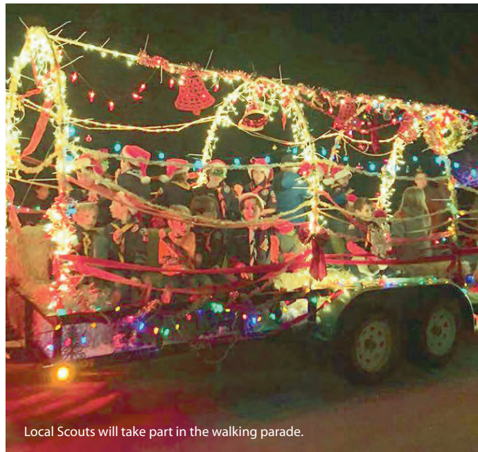
Local Scouts will take part in the walking parade.

Attendees should be ready for an ice skating rink, the Frozen sisters-Anna & Elsa, Santa, a live Nativity and all the extras including a Children's area, vendor booths, the gorgeous