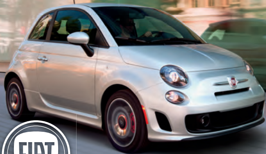
2016 FIAT® 500