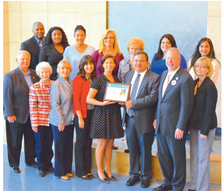
Staff at Oakbend Medical Center poses with the Gold Plus Award for its program that promotes adherence to the latest scientific treatment guidelines for stroke victims.

To find out more about OakBend Medical Center’s Award Winning Stroke Program log onto www.oakbendmedcenter.org .