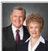
THE LANE TEAM

Property Management | Commercial Real Estate