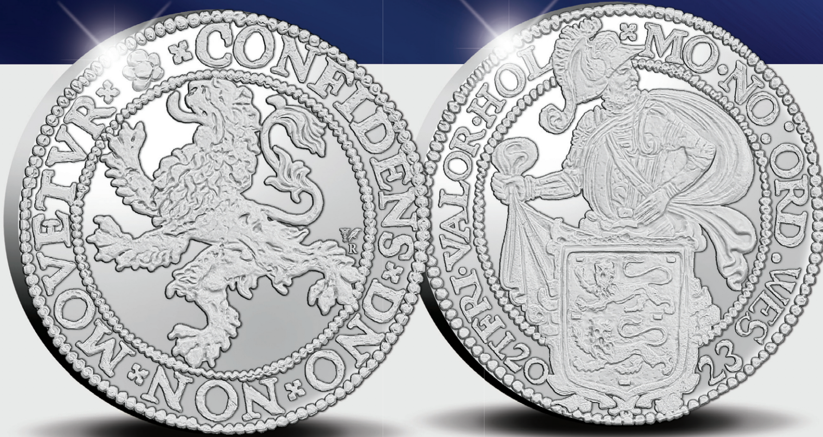
Shown larger than 38.7mm diameter