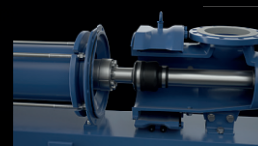
Rotor Joint Access (RJA)