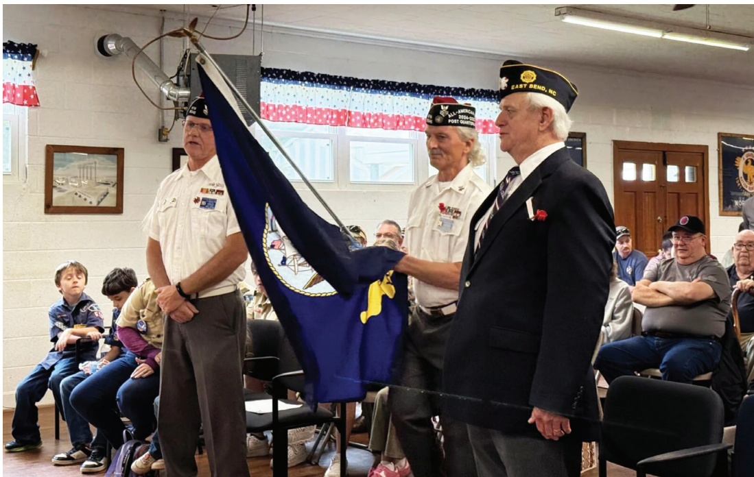
Members of the Yadkin County Veterans Council present the flags of each branch of service during a Memorial Day ceremony.

he said. "The thoughts and emotions that we feel as we honor our military service members of the past. That patriotism carries a high price. Because freedom is not free."