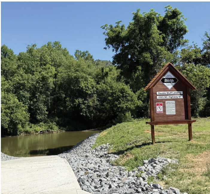
KITSEY BURNS HARRISON

than five miles of walking, hiking, and running trails, more than five miles of mountain bike trails, an 18-hole disc golf course, a playground for families and children, river access for boating and fishing, picnic shelters, and dress room facilities," she continued. "This project represents years of planning, partnership, and investment in the future of our community. It holds opportunities for recreation, promotes healthy, lifestyles, encourages tourism, and preserves the natural beauty of the Yadkin River for generations to come."