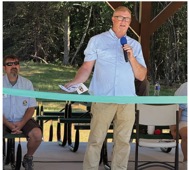
KITSEY BURNS HARRISON

River access point and boat ramp at the newly unveiled Double Bluff recreation area in Jonesville.