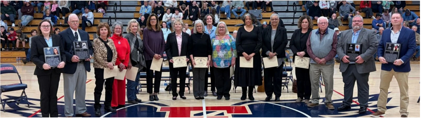
Honorees of the Class of 2026 Forbush Hall of Fame.