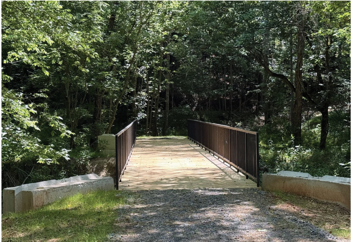
A bridge along one of the trails at the Double Bluff recreation area in Jonesville.

N.C. Trails Days festival was conceived to promote tourism and travel for nature lovers to enjoy the natural beauty of the region and showcase the multiple trails in Elkin and Jonesville.