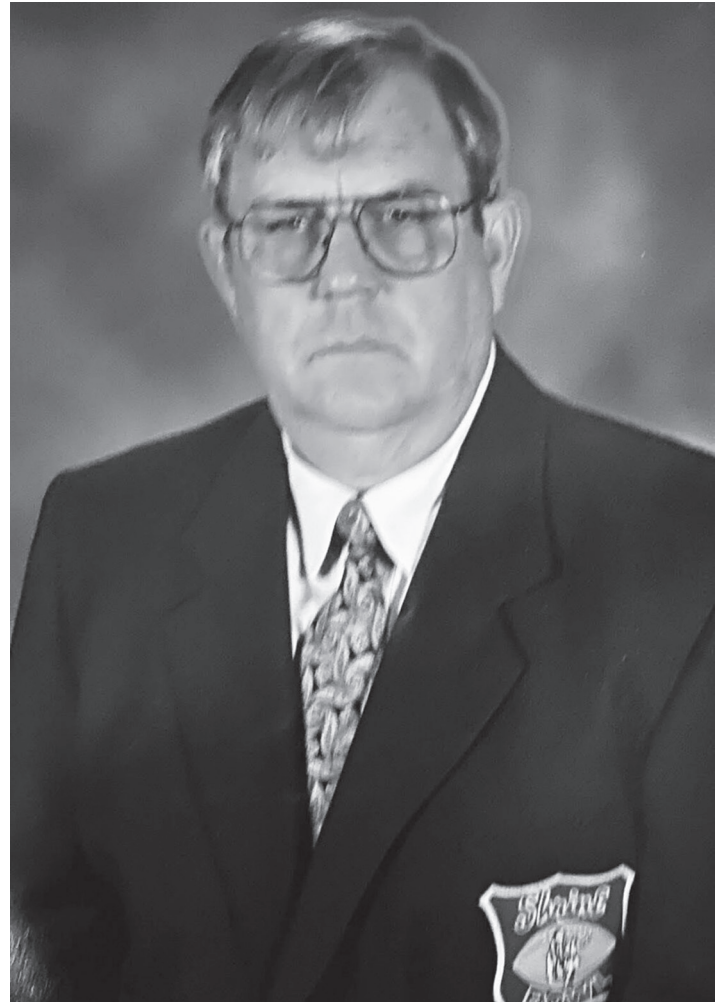
STARMOUNT HIGH SCHOOL