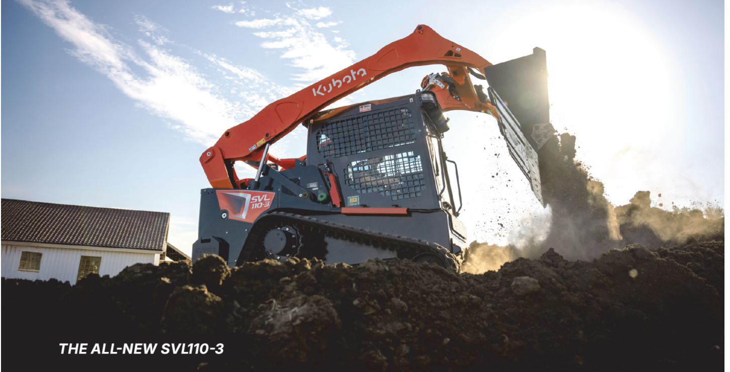
THE ALL-NEW SVL110-3