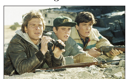
Metro-Goldwyn-Mayer Studios Inc.

The Motion Picture Association of America introduced the PG-13 rating on July 1, 1984, in reaction to blood and gore in “Gremlins” and “Indiana Jones and the Temple of Doom.” “Red Dawn” is the first PG-13 movie.