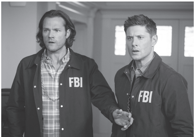
Jared Padalecki and Jensen Ackles star in "Supernatural"

An old friend visits Sam (Jared Padalecki) and Dean (Jensen Ackles) in this new episode of the popular series. Meanwhile, Castiel (Misha Collins) investigates when a local teenager disappears. Alexander Calvert and Mark Pellegrino also star.