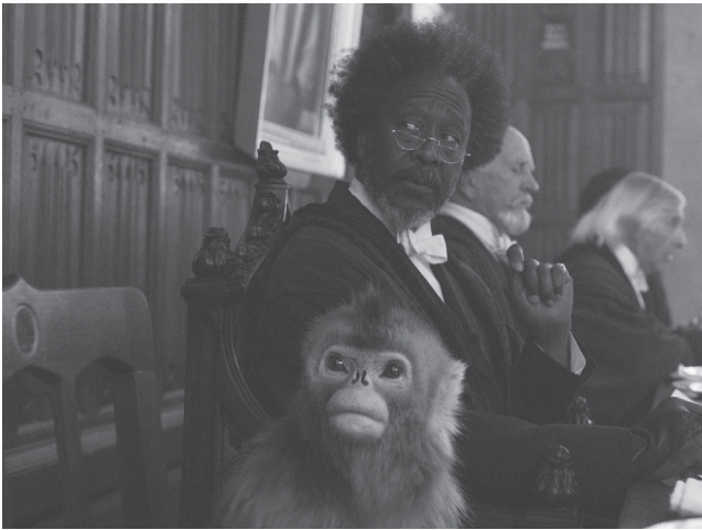
Clarke Peters as Dr. Carne in "His Dark Materials"

After having a heart attack, a middle aged man falls for his Nigerian nurse. Bob (Billy Gardell) is undaunted by how different he and Abishola (Folake Olowofoyeku) are, and he's determined to win her heart in this new comedy series.