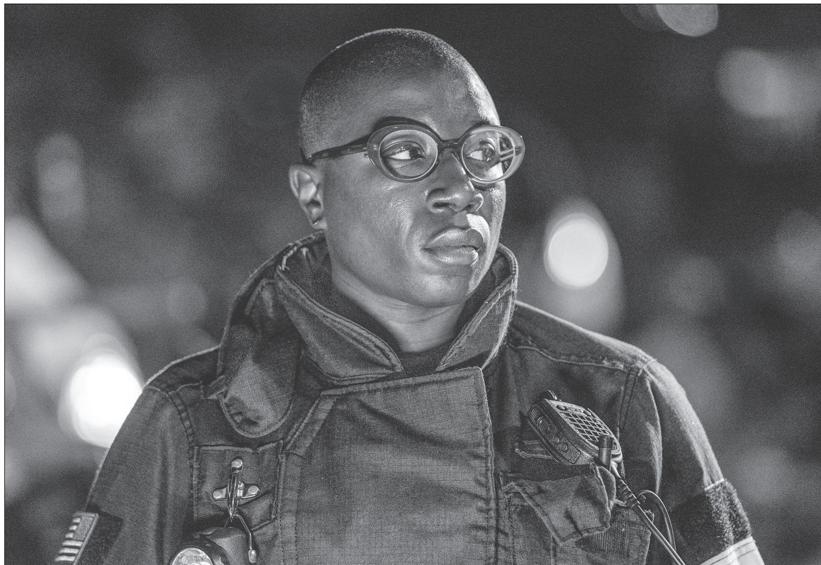
Aisha Hinds in a scene from "9-1-1"

On Monday, Nov. 18, Fox presents another episode of this hit series, which takes viewers to the City of Angels to witness brave first responders in action. The show follows police officers, paramedics, firefighters and dispatchers on the job and at home. Like many other procedurals, "9-1-1" focuses on the lives of the responders themselves, not just the dramatic disasters they're called to — it sends a clear message that the men and