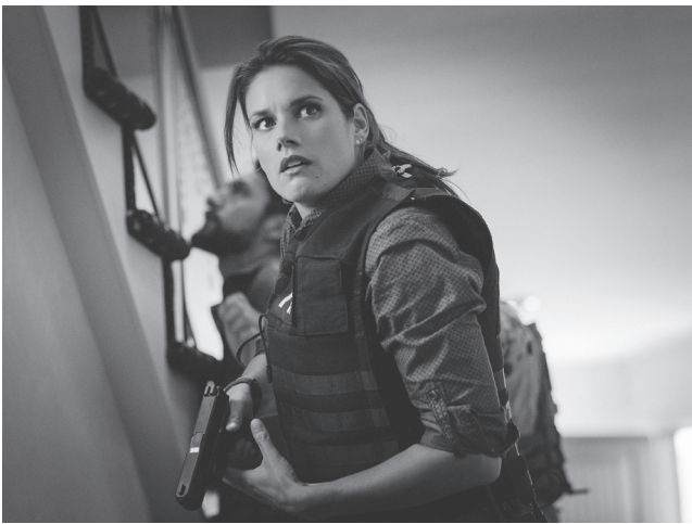
Missy Peregrym in “FBI”

FBI agent Maggie Bell (Missy Peregrym) works alongside her partner OA Zidan (Zeeko Zaki) to keep the people of New York City safe in a new episode of this action-packed drama. They’re part of an elite unit that investigates organized crime and terrorism.