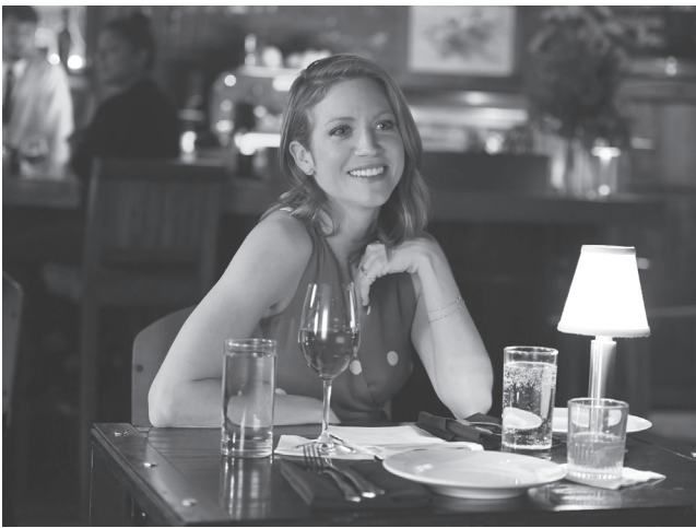
Brittany Snow in "Almost Family"

When her dreams of rock stardom don't work out, Laney Lewis (AJ Michalka) takes a job teaching music at her old high school. Despite their foibles, she and her fellow teachers (Bryan Callen, Tim Meadows, Brett Dier) realize they're heroes to students.