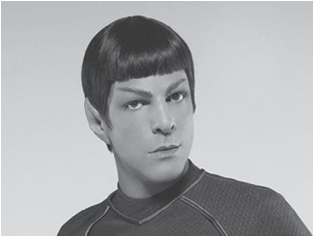
Zachary Quinto stars in “Star Trek”

A young James T. Kirk (Chris Pine) is recruited to Star Fleet, where he and his crew battle Nero (Eric Bana), a Romulan out for revenge. This reboot of the iconic sci-fi franchise also stars Zoe Saldana, Simon Pegg and Zachary Quinto.