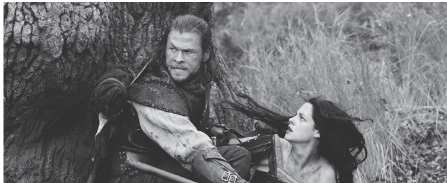
Chris Hemsworth and Kristen Stewart in “Snow White and the Huntsman”