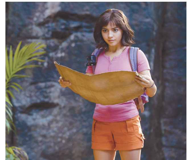
Isabela Moner stars in "Dora and the Lost City of Gold"