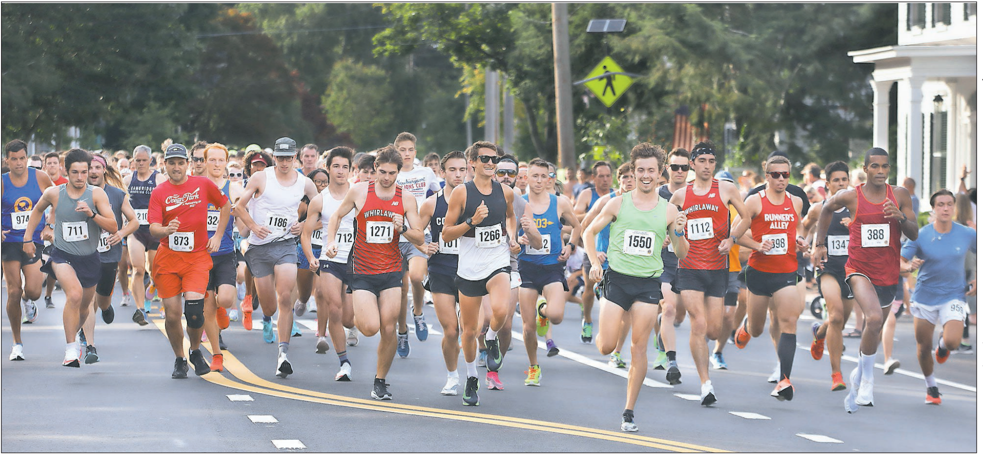
Runners set out on High Street in the Yankee Homecoming 5K Race in Newburyport.