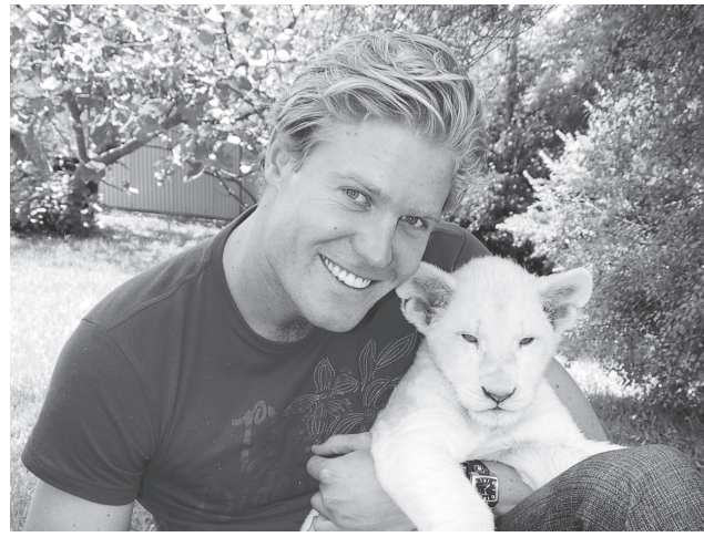
Dr. Chris Brown as seen in "Dr. Chris Pet Vet"

Renowned veterinarian Dr. Chris Brown invites cameras Down Under as he cares for animals of all shapes and sizes. He and his colleagues use technologically advanced treatments to help a variety of animals in his clinic.