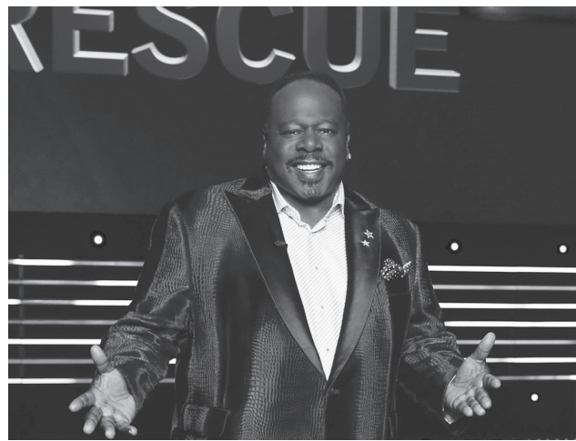
Cedric the Entertainer hosts "Lip Sync to the Rescue"

In this new episode of the popular dance show, only the best of the best are left in the competition. The dancers continue to give incredible performances as they fight to show why they belong in the Top Four and deserve to be America's favorite dancer.