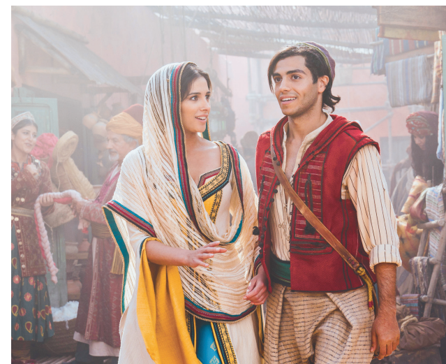
Naomi Scott and Mena Massoud star in "Aladdin"

When police Chief Cliff Robertson (Murray) and officer Ronnie Peterson (Driver) are called to investigate a missing chicken by farmer Frank Miller (Buscemi), they notice a number of strange events happening in their town. After night falls in Centerville, recently deceased human corpses begin to reanimate and terrorize residents. Preparing for battle, Cliff and Ronnie join up with fellow police officer Mindy Morrison (Sevigny) and new funeral home undertaker Zeld Winston (Swinton) to save the town from the undead. Director: Jim Jarmusch. Stars: Bill Murray, Adam Driver, Tom Waits, Chloë Sevigny, Steve Buscemi, Austin Butler, RZA, Tilda Swinton, Eszter Balint, Danny Glover. 2019. 104 min. Comedy.