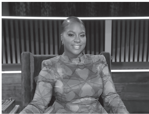
Ester Dean in "Songland"

In this new episode, the chefs continue their London adventure when they travel to the historic Hatfield House. Not only do they cook for judges Gordon Ramsay, Joe Bastianich and Aarón Sánchez, but also for British cooking royalty Nigella Lawson.