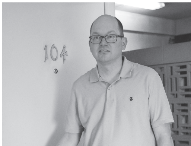
Mark Proksch in "Room 104"

Cameras tag along as Guy Fieri looks for flavor in this new episode. He travels to Santa Fe, where a Southwest-Middle Eastern quick stop slings shawarma and salmon souvlaki. In Kansas City, he visits an eatery serving up Scandinavian specialties.