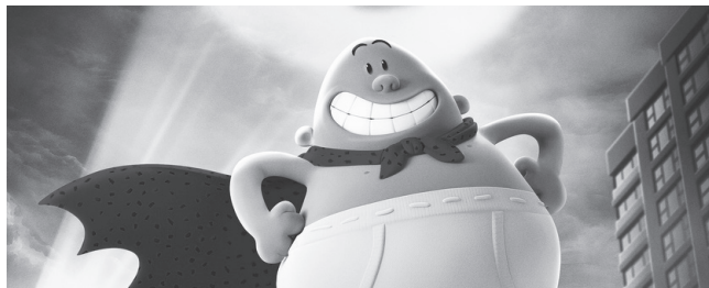
A scene from "Captain Underpants: The First Epic Movie"