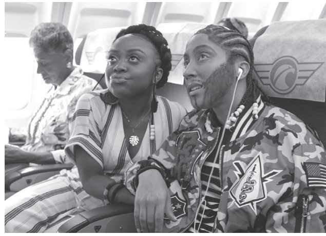
Quinta Brunson and Robin Thede in "A Black Lady Sketch Show"

In this rebroadcast, hosts Matt Iseman, Akbar Gbajabamila and sideline reporter Zuri Hall head to Cincinnati for the City Finals round of the competition. Contestants face up to 10 challenging obstacles including "Slam Dunk," which is new to the course.