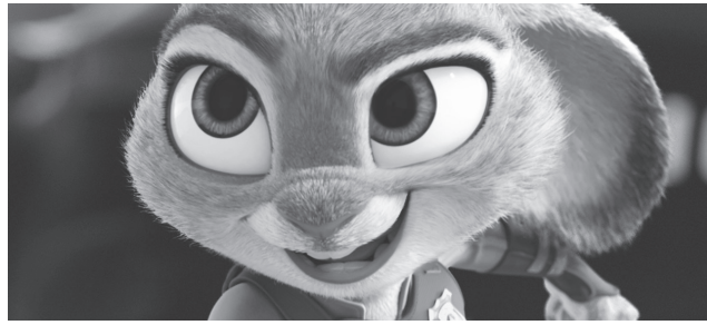
Judy Hopps in "Zootopia"