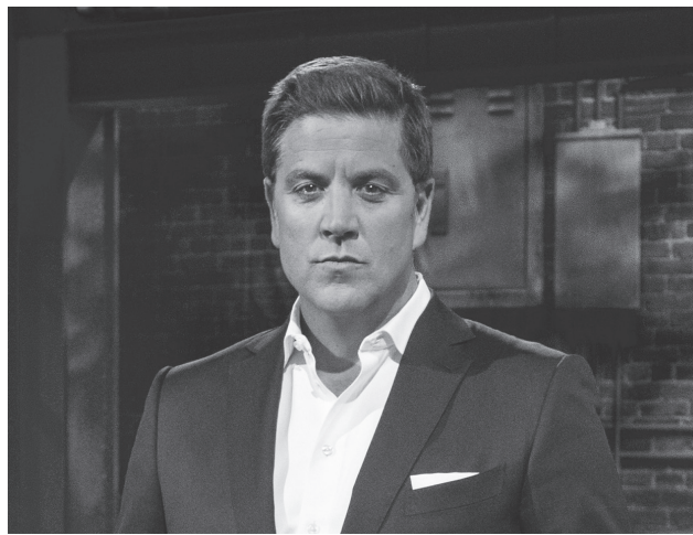
Josh Elliott hosts "First Responders Live"

When a key witness and a U.S. marshal are ambushed and murdered, Maggie (Missy Peregrym) and OA (Zeeko Zaki) investigate in this rebroadcast. They look for the person responsible for leaking the information that led to their deaths.