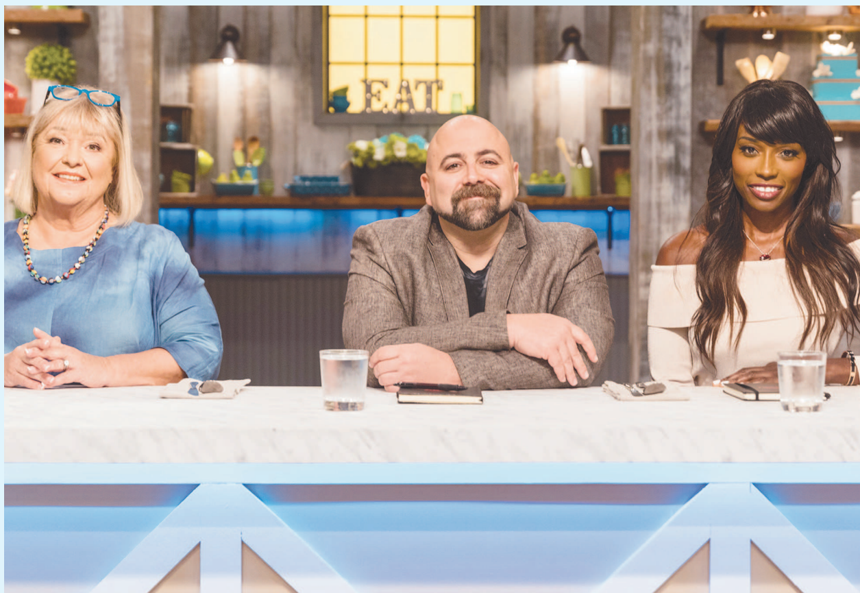
"Spring Baking Championship" judges Nancy Fuller, Duff Goldman and Lorraine Pascale

'Spring Baking Championship' returns for a fourth season