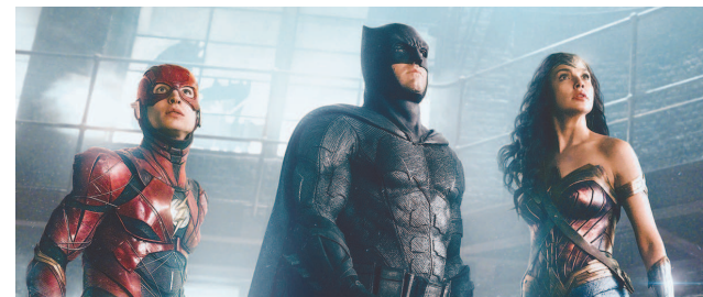
Ezra Miller, Ben Affleck and Gal Gadot in "Justice League"