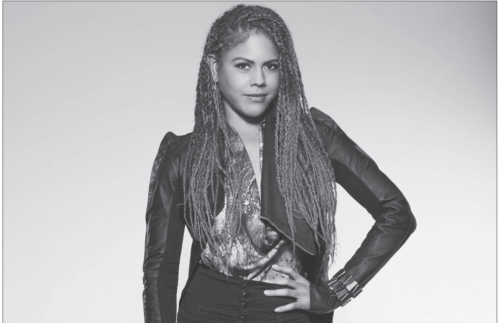
Lenora Crichlow in "Deception"

"When we look at each one of our stories, we want to do as much magic that's real that we can," Fedak explained. "The