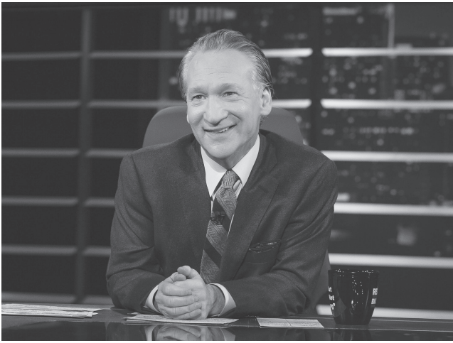
Bill Maher in "Real Time With Bill Maher"

Guy checks out all different kind of food as he travels through Flavortown in this new episode. A chili-churning diner in Boulder City, Nevada, keeps it all in the family, and an old-school breakfast spot has expanded across Arizona.