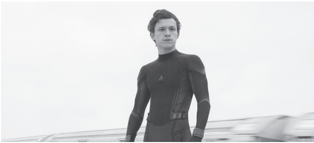
Tom Holland in "Spider-Man: Homecoming"