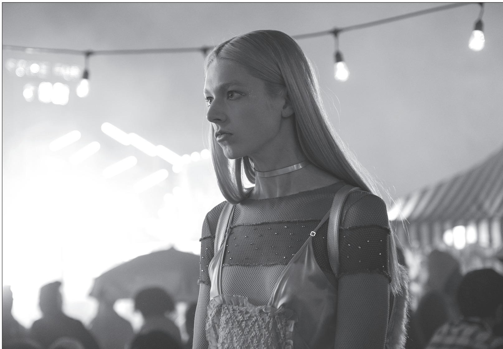
Hunter Schafer in a scene from "Euphoria"

"Euphoria" follows a group of Generation Z (the group that came right after Millennials) students as they navigate their way through their late teen years into adulthood, and deal with the problems unique to their generation. Racy videos posted online, fentanyl abuse and social media drama weren't issues you had to deal with in high school before Generation Z came along, but the classic