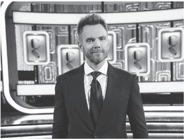
Joel McHale hosts “Card Sharks”

Joel McHale hosts as contestants play an intense card game in the hopes of winning as much as $10,000 in this update of the classic game show. Contestants are invited to predict which cards are higher or lower as they play across the game board.