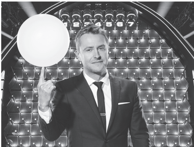
Chris Hardwick hosts "The Wall"