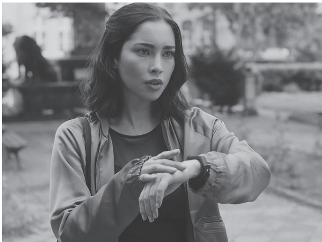
Priscilla Quintana stars in "Pandora"