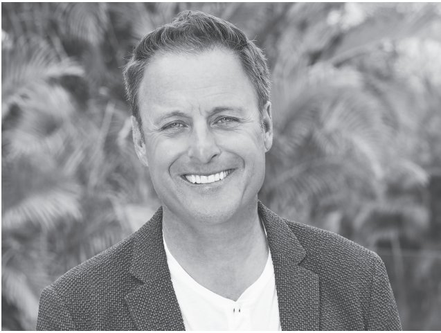
Chris Harrison hosts "Bachelor in Paradise"

Leonard (Johnny Galecki) is surprised when his mother, Beverly (Christine Baranski) turns up for a visit and treats him kindly in this rebroadcast. Meanwhile, Stuart (Kevin Sussman) and Denise (Lauren Lapkus) overstay their welcome.