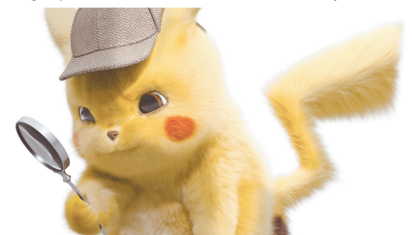
Pikachu from "Detective Pikachu"