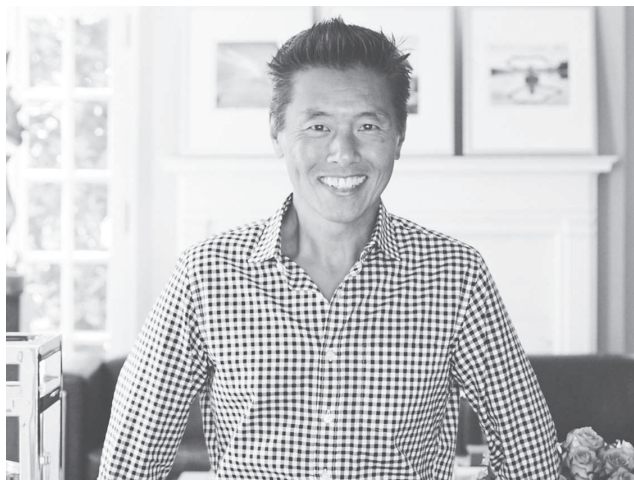
Vern Yip from "Trading Spaces"

Interior designers team up with homeowners to redecorate rooms in their neighbours' houses in a brand new season of this groundbreaking home show. Paige Davis returns to host the series, which features a rotating roster of design and carpentry experts.