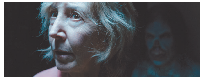
Lin Shaye in "Insidious: The Last Key"