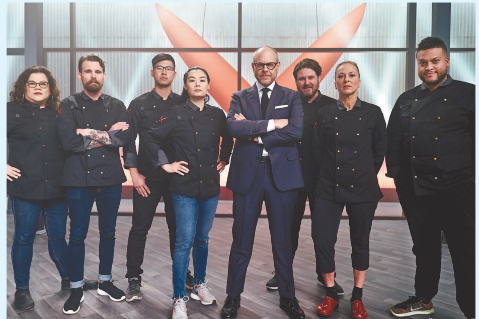
Host Alton Brown with the "Iron Chef Gauntlet" competitors

Seven skilled chefs aim for the ultimate culinary prize