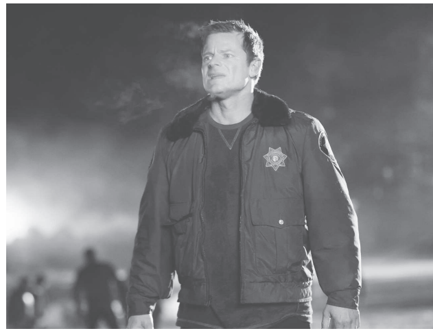
Steve Zahn in "The Crossing"

With two anachronisms to deal with, the timeline is barely stable in this new episode. Meanwhile, Nate (Nick Zano) and Wally (Keiynan Lonsdale) try to prevent another Legend from changing her future. Brandon Routh and Dominic Purcell also star.