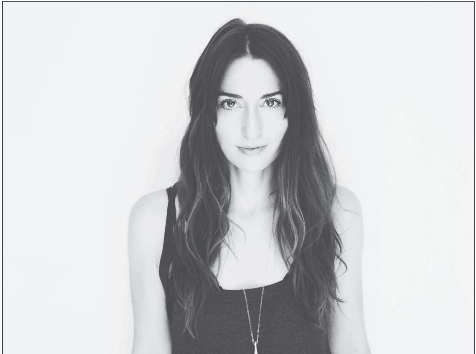
Sara Bareilles stars in "Jesus Christ Superstar Live in Concert"

While this is Legend's first leading role in a televised musical, it's not his first screen gig — he played the role of Keith in the multiple award-winning feature