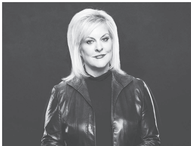
Nancy Grace from "Grace vs. Abrams"