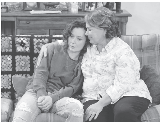
Sara Gilbert and Roseanne Barr in "Roseanne"

When Darlene (Sara Gilbert) loses her job, Roseanne (Roseanne Barr) and Dan (John Goodman) Conner welcome her and her two children to stay with them. The iconic sitcom also stars Laurie Metcalf, Alicia Goranson and Michael Fishman.