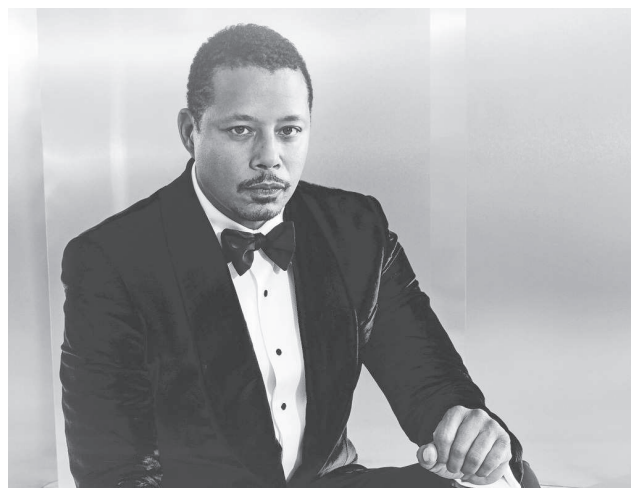
Terrence Howard stars in "Empire"

While on the brink of nailing down an important tech deal, Eddie (Forest Whitaker) realizes that Empire needs to be rebranded in this new episode. Meanwhile, a girl group re-unites and threatens to expose long-buried secrets from the past.