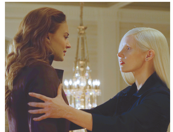
Sophie Turner and Jessica Chastain in "Dark Phoenix"