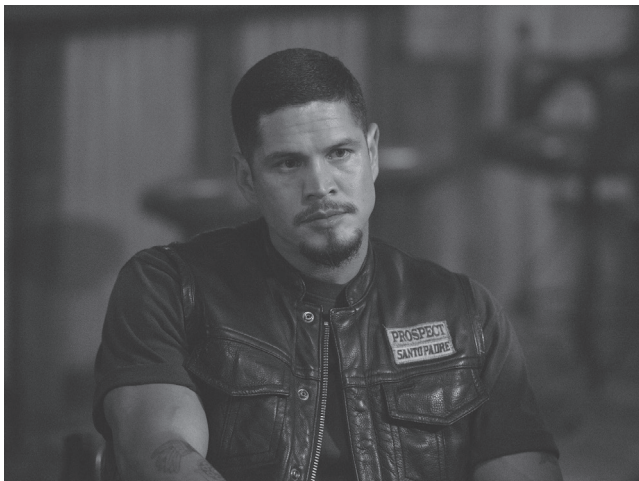
JD Pardo in "Mayans M.C."

Four chefs are asked to incorporate bizarre ingredients into their dishes in this new episode. When they open their appetizer baskets, they find a strange pig part. The second basket contains a fuzzy vegetable and a surprising meat.