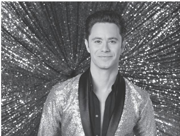
Sasha Farber from "Dancing With the Stars"

Richard Rawlings and the Gas Monkeys crew enter the world of stock car racing in this new episode. They transform a '52 Chevy Coupe into a fire-breathing dirt track racer. Later, Richard teams up with a member of NAS-CAR royalty.