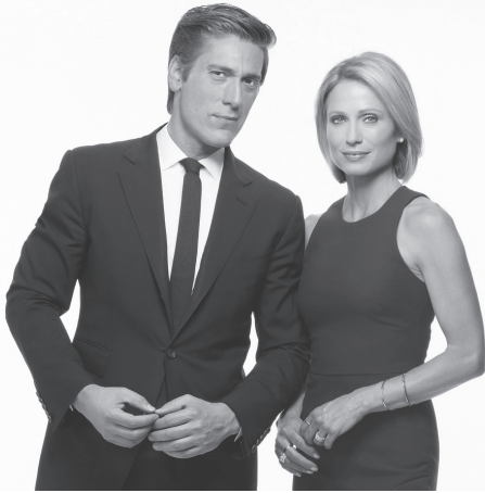
David Muir and Amy Robach host "20/20"

Tyra tries to induce labor, but things don't go as planned in this rebroadcast. At the same time, Hailey gets depressed when Matthew is nowhere to be found, and Anthony's family doubts he's really the father of Rilah's baby.