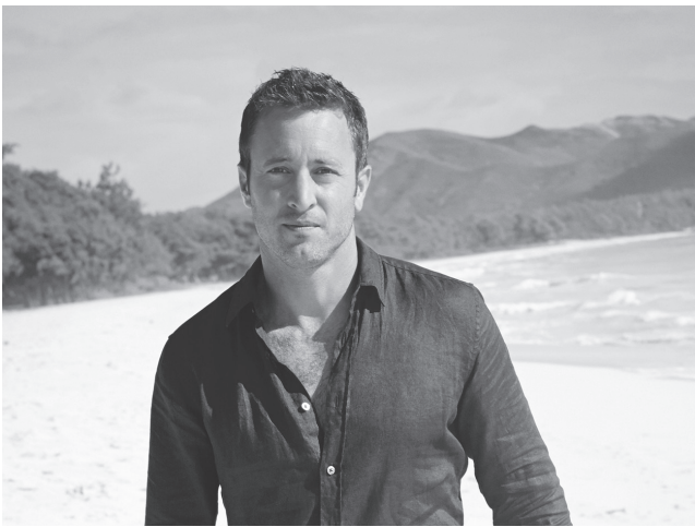
Alex O'Loughlin in "Hawaii Five-0"

The Five-0 continues to hunt down Aaron Wright (Joey Lawrence), an escaped criminal who intends to sell cyber weapons to the highest bidder in this rebroadcast. Also, a visitor at headquarters puts McGarrett (Alex O'Loughlin) and the team in danger.