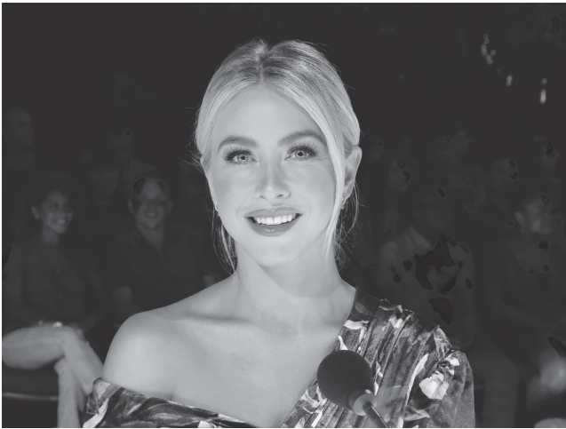
Julianne Hough in "America's Got Talent"

Gordon Ramsay, Aarón Sánchez and Joe Bastianich mentor the remaining home cooks as they compete for the $250,000 prize in this season finale. Each week, the home cooks faced culinary challenges designed to test their skills in the kitchen.