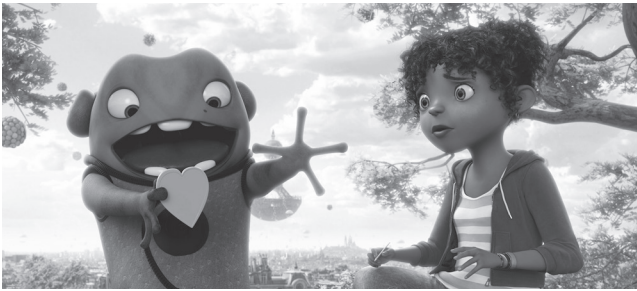
A scene from "Home"