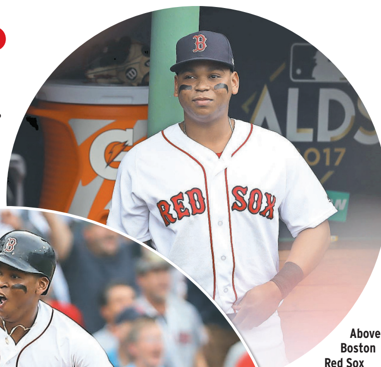
Above, Boston Red Sox rookie Rafael Devers waits to come out for pregame introductions against the Houston Astros in the ALDS. At left, Devers celebrates his two-run homer off Houston Astros reliever Francisco Liriano.

"He's as gifted a hitter as there is," said Ottavino. "He's got a really good swing. His hands are strong. He covers the entire plate.