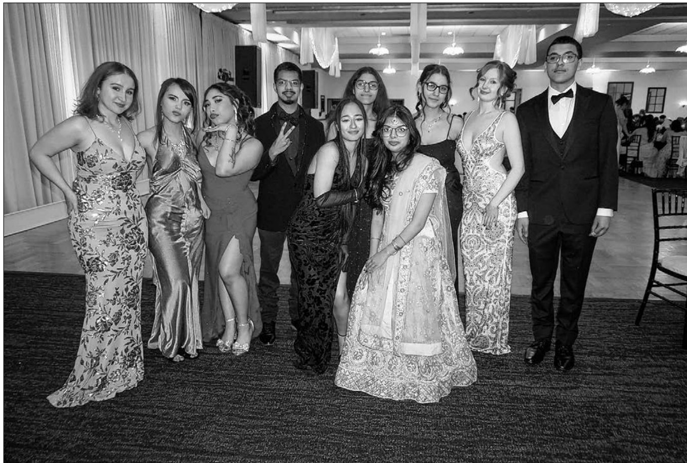
Students pose for photos at “The Great Gatsby” themed Junior Prom in Methuen in April.

While the event was organized specifically for Methuen High School juniors, guests from other grades and schools were allowed