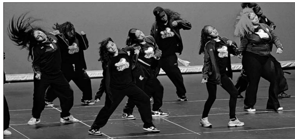
More than 90 students of all ages from five Lawrence high schools gathered at the Lawrence High School Performing Arts Center to celebrate the art of dance, and showcase what they have worked on throughout the year.