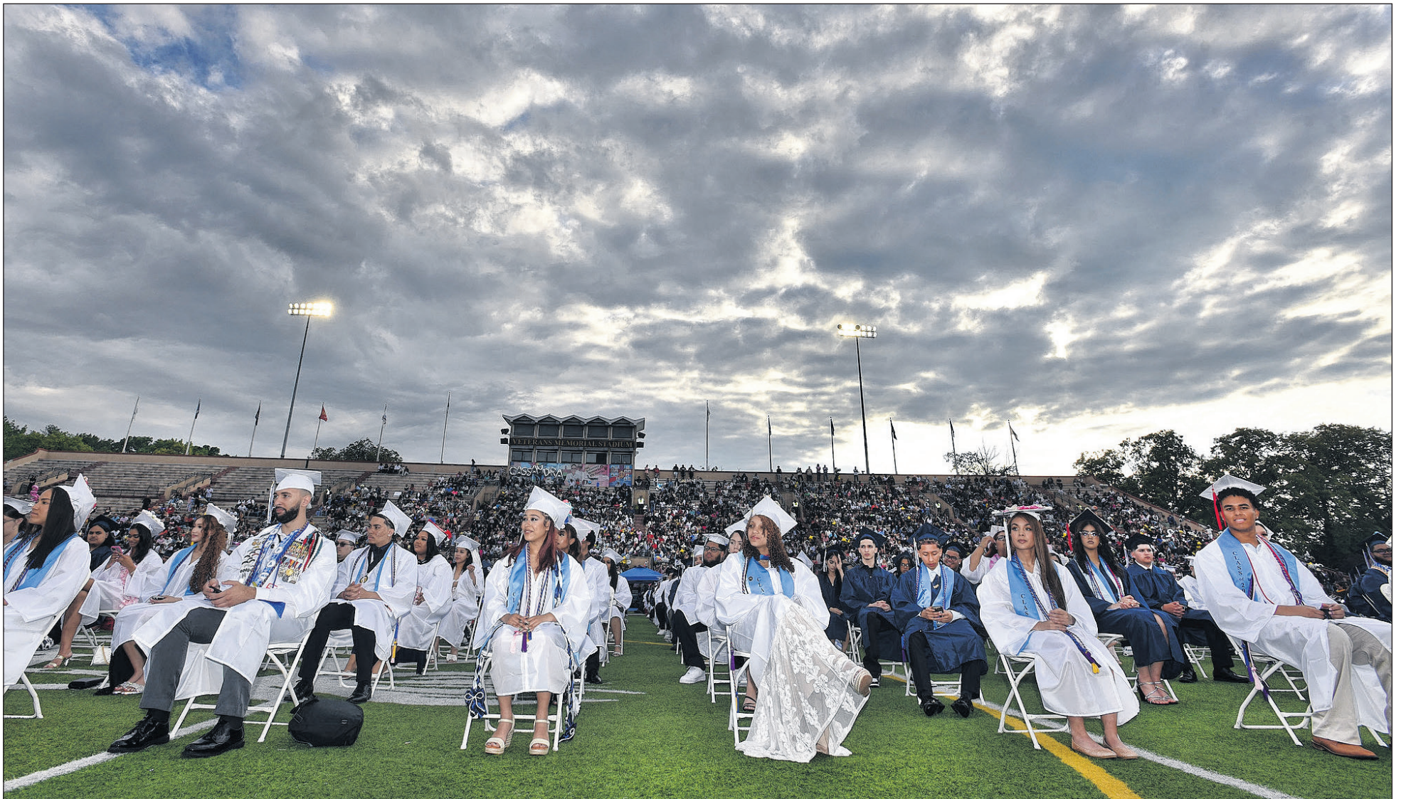
Under a dramatic sky, Lawrence High School seniors wait patiently to receive their diplomas at Veterans Memorial Stadium on May 30.

year. And if you look closely — sometimes just glance — you'll often see yourself, a classmate, or a close friend.